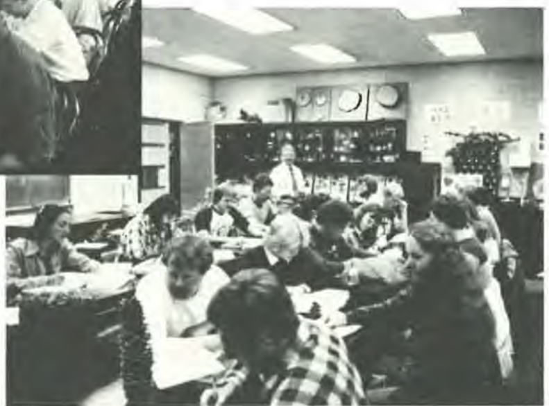
Top: dendrology class, 1926; bottom: dendrology class, 1984. Could one of these be posed?