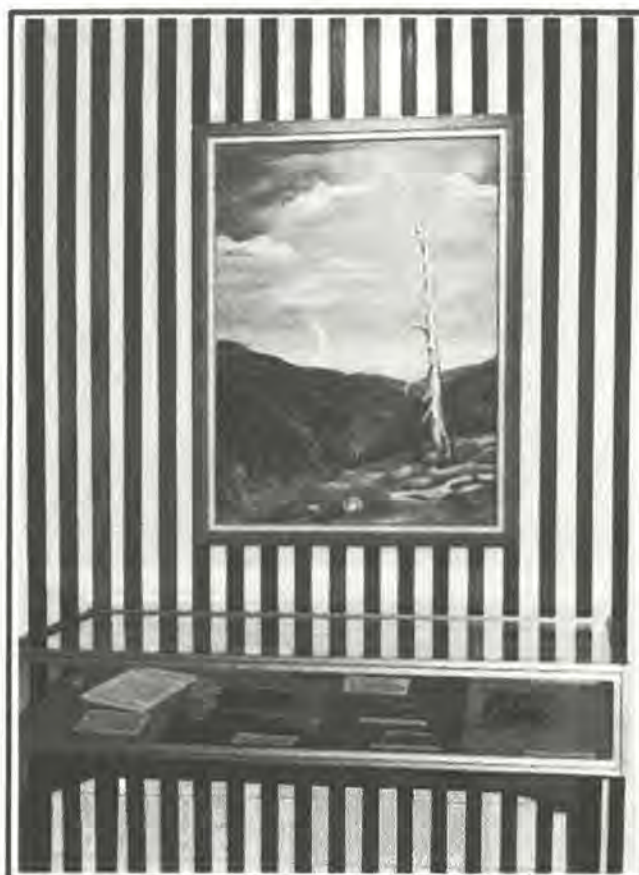
The Snag painting original now hangs in the FWR Building's west foyer, over an exhibit recounting "The Story of the Snag," and only a few feet from the Snag itself.