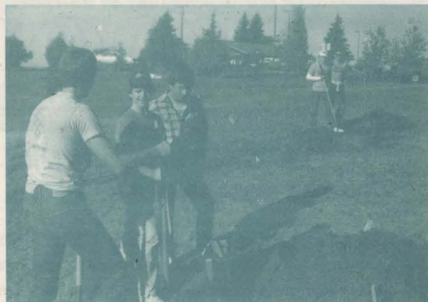
Many student groups have volunteered for Arboretum work projects. These groups include Tau Beta Pi, Delta Tau Delta, Alpha Gamma Sorority and Blue Key Honor Society.