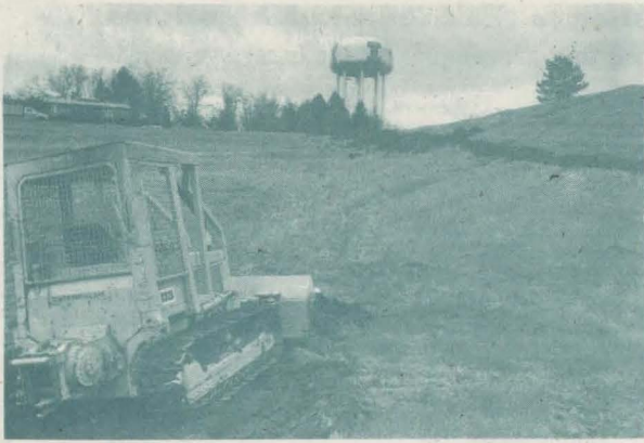
Road construction, summer 1985.