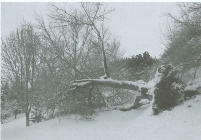
Winter damage 11-19-13.