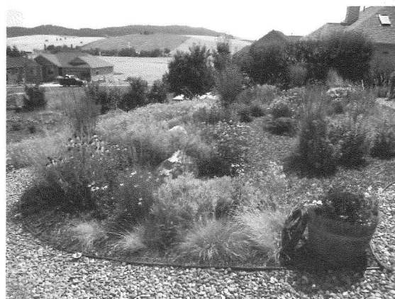
Wisescape July 2013 view looking south.