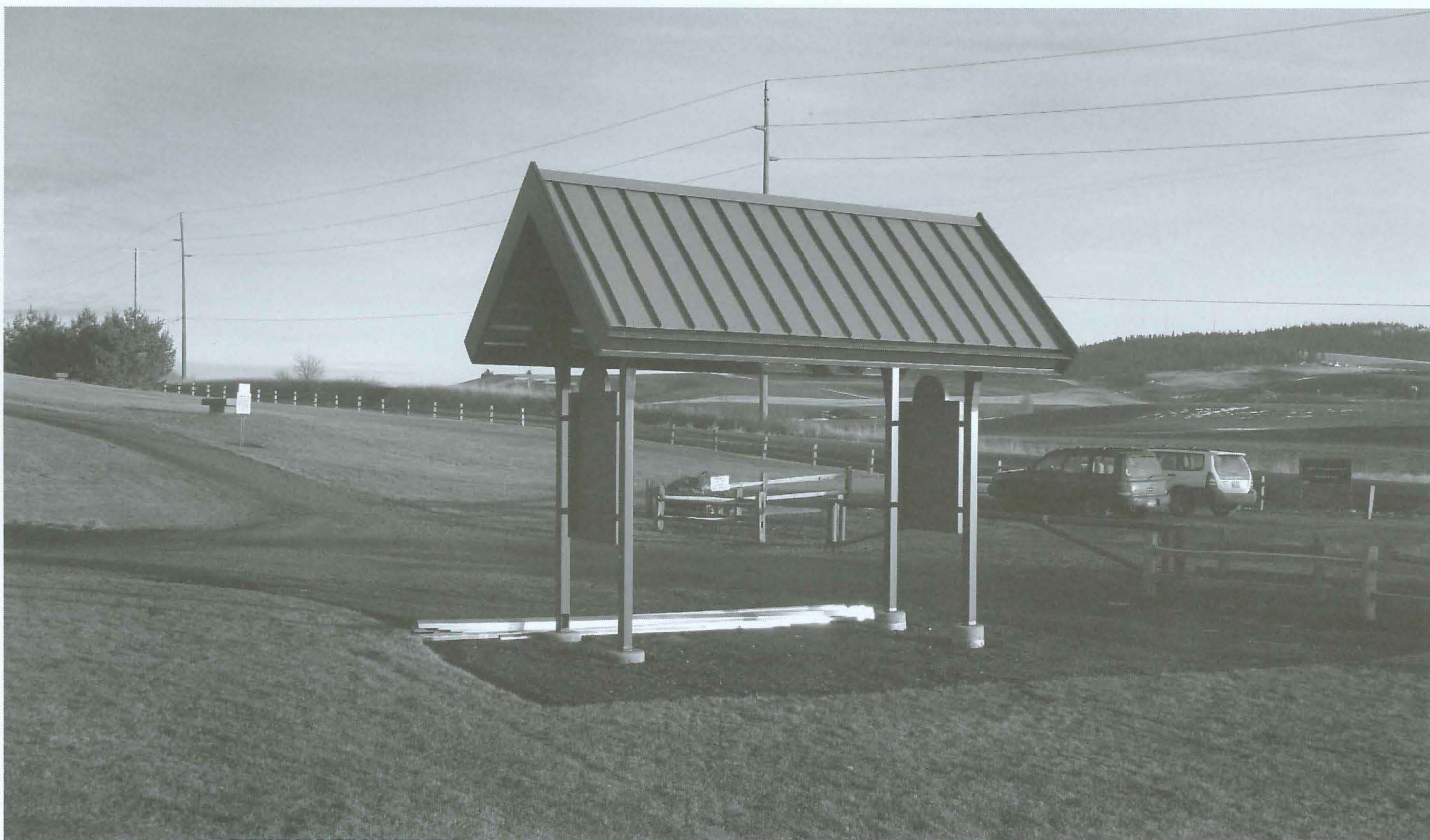
Malcolm and Carol Renfrew Arboretum Shelter