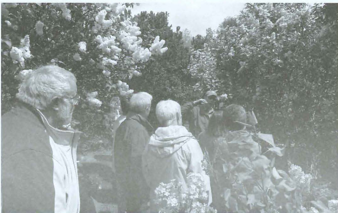
Spring UIIRA tour 5-16-13.