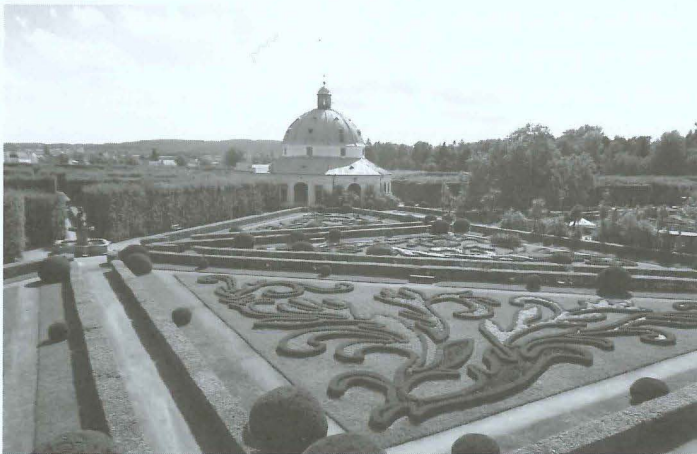
Kromeriz Castle Flower Garden, Czech Republic 9-12-13.