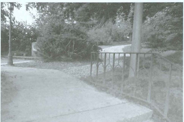
WWI grove new entry 7-2-13.

Spruce trees at the east end of the Shattuck Arboretum, south of Administration Building. The trees were planted to memorialize the 32 University of Idaho students killed in World War I. The Oaks are readily identifiable; unfortunately, we have not been able to identify the specific Spruce trees, but there are several likely candidates grouped around the Oaks. There has been no formal recognition of the grove, and that end of the Shattuck Arboretum has always been difficult to access—so, we set out to remedy both of those situations. The Arboretum Associates Board approved spending the proceeds from this year's annual plant sale to fund the project.