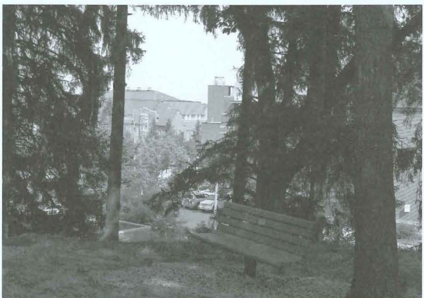
WWI grove with new bench 8-8-13.