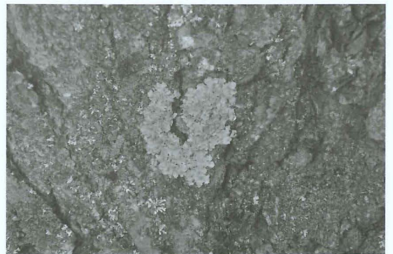
Lichen with abundant apothecia growing on a crabapple tree that was planted in the Arboretum in 1995.