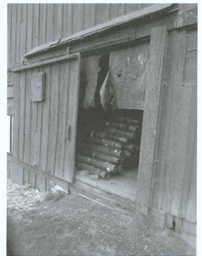
Recycled nursery pots saved from the landfill 10-11-13.