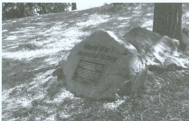
WWI grove memorial rock 7-22-13.

The biggest single project was the restoration of the historic World War I Memorial Grove in the Shattuck Arboretum. In 1919 the University planted 10 Red Oaks and 22