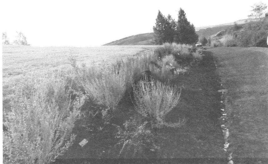
AFTER - HarleyWright collection 10-23-14. PaulWarnick photo