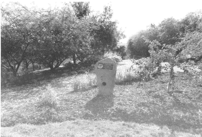
Hosta Display Garden plaque 9-30-14.

We also continued our efforts to automate the irrigation system in the Arboretum. We installed another phase of underground sprinklers in the lower east side of the Arboretum this summer. Somewhere in the area of 80% of the Arboretum that is irrigated is now automated, reducing the amount of time spent dragging hoses and sprinklers to a minor chore. The automated systems have clearly improved the delivery of the irrigation; now the irrigated parts of the Arboretum are a consistent green. There is no way to know if we are actually using less water, but the entire University re-claimed irrigation system is using significantly less water than when I started 14 years ago. Since the changes on the