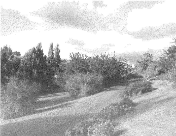
Rose border enhances the fall colors on a cloudy day, October 2014.