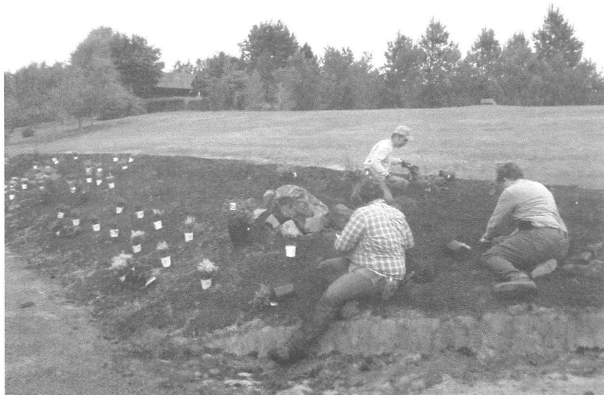
BEFORE - Planting HarleyWright collection 6-24-14.

We also began two other plantings, neither one of which is very obvious yet. The first is a collection of herbaceous Peonies ( Paeonia ) honoring the career of retired English faculty member, Joy Passante. The collection is going on the slope in the north east corner of the Arboretum, facing west. The goal is to provide a walkway between two existing bench sites and to make a colorful splash for vehicles coming up Nez Perce Drive from the west. So far we have planted 67 peonies of 22 different cultivars. The plants were planted as bareroot divisions in October. Realistically, it will be at least two years, and more likely three, before most of the plants produce enough flowers to make a show.