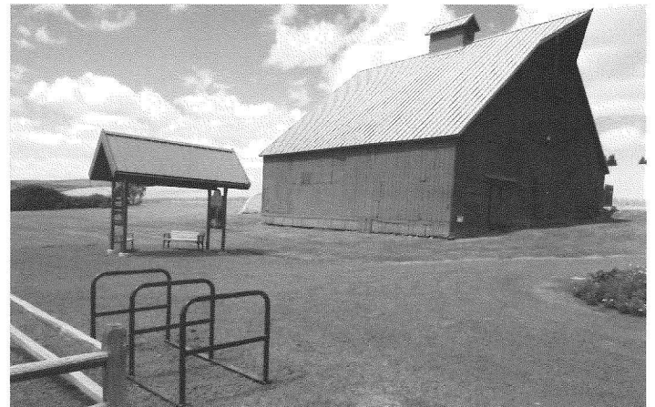
Bike rack and Renfrew Shelter 7-24-14