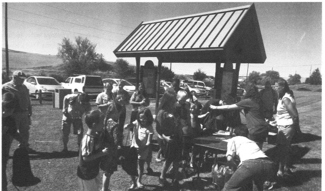
Eager participants get prepared to explore during Science Saturday 7-26-14.