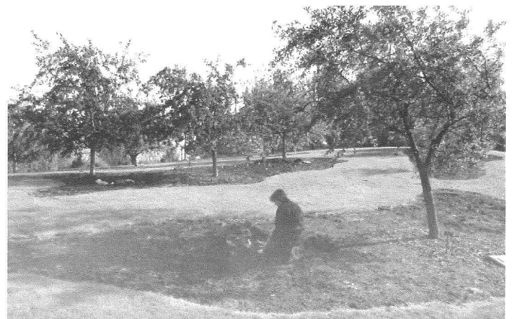
Planting peonies 10-16-14.