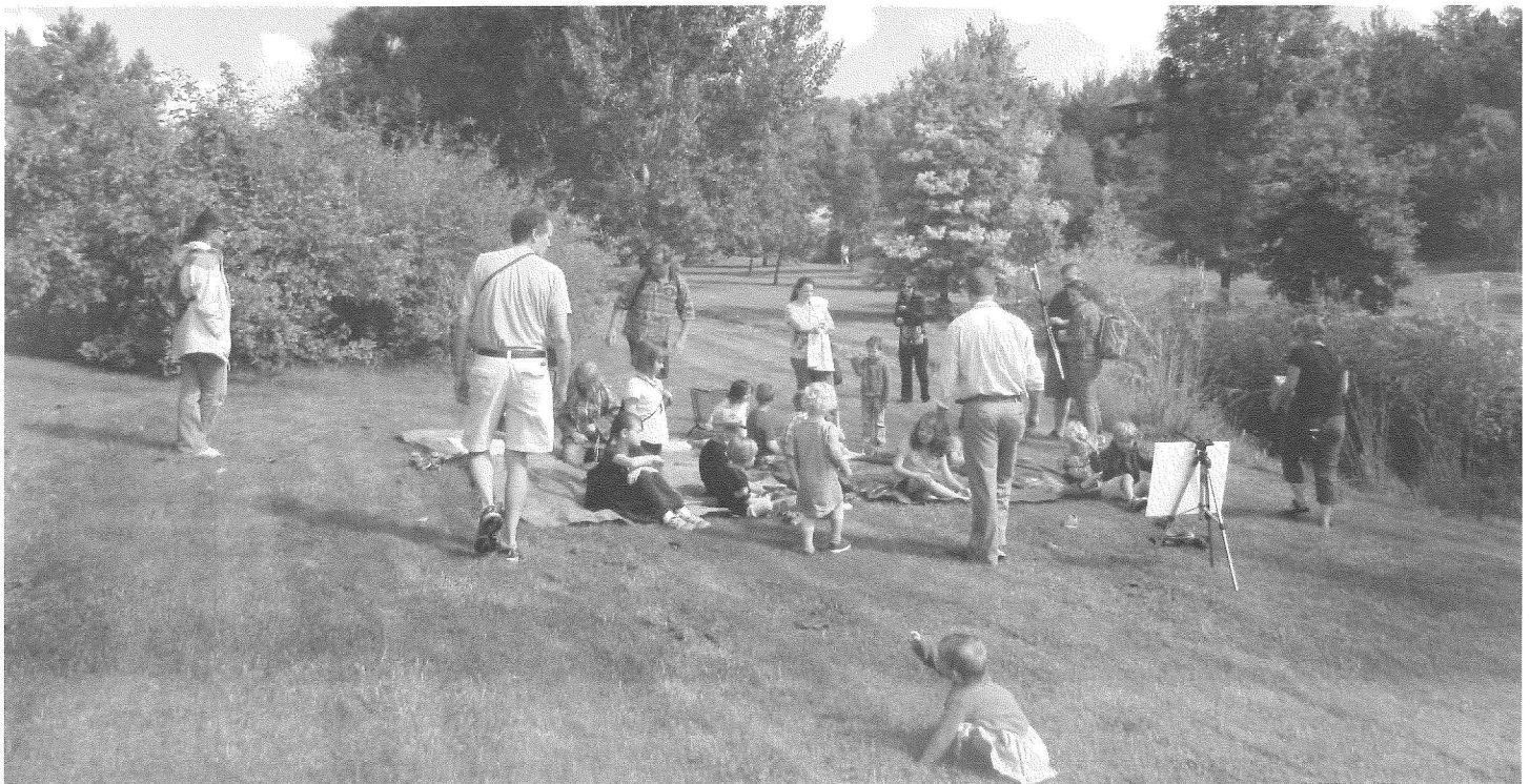
Learning about observation and sketching 8-23-14.

All three programs were very well-attended, and we are pleased to announce another season of Science Saturdays in the Arboretum for 2015. We are seeking groups or individuals who are interested in designing and delivering a one-hour program in their area of expertise geared toward school-aged children to be presented on one of the following Saturdays: June 20, July 18, and August 15. A $250 stipend and cost of materials up to $150 will be awarded to three successful applicants. This is an exciting