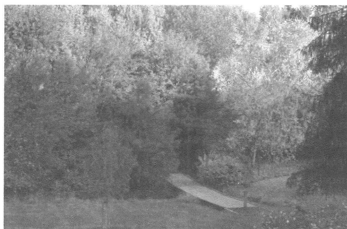
Bridge and Fall colors, October 2014.