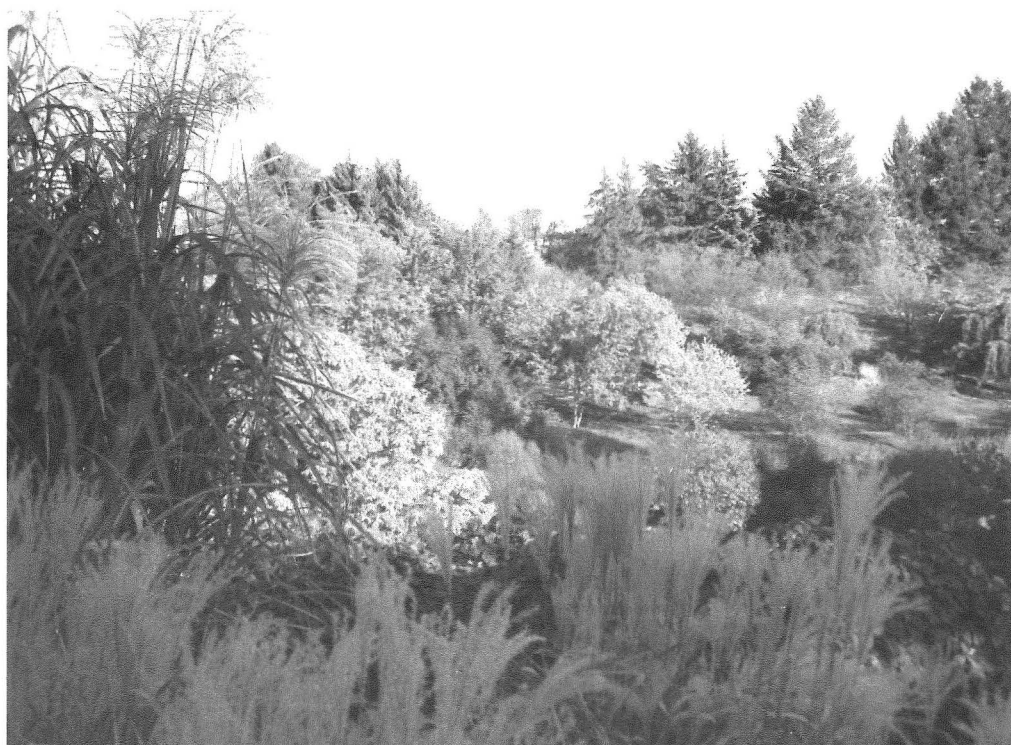
View of the Arboretum above the pergola October 2014.