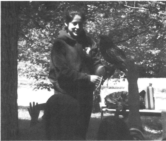
WSU Raptor club presents the first Science Saturday 6-23-14.

We look forward to seeing you during the Science Saturdays in the Arboretum 2015 season!