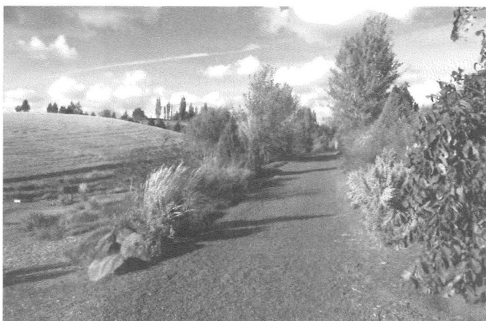
Path above the Zeriscape garden overlooks the harvested wheat field. October 2014.