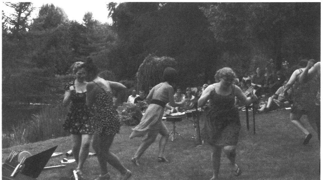
A lively time for performers and audience members at the Summer Breezes and Sweet Sounds Concert 7-14-14.