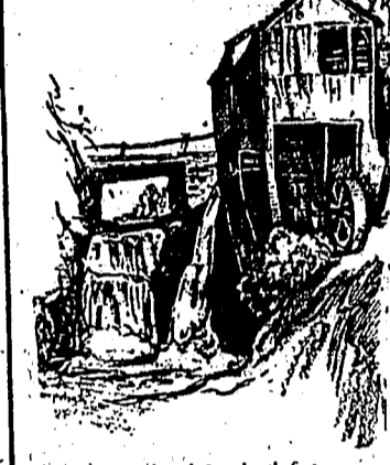
A power plant of this when the first Du Pont power mill was built