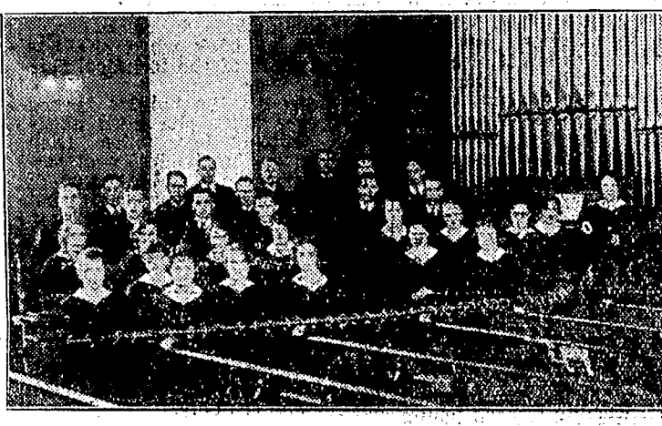
FIRST LUTHERAN CHOIR