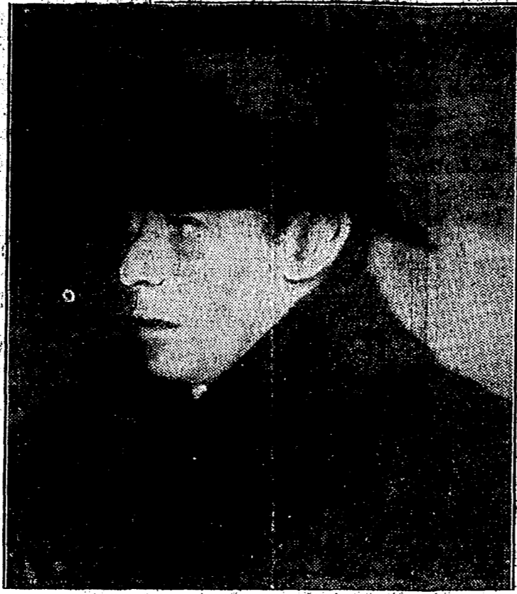
This radiophoto, the first picture of Great Britain's new king since the abdication of Edward, shows the former Duke of York as he returned to his London home from Windsor castle.