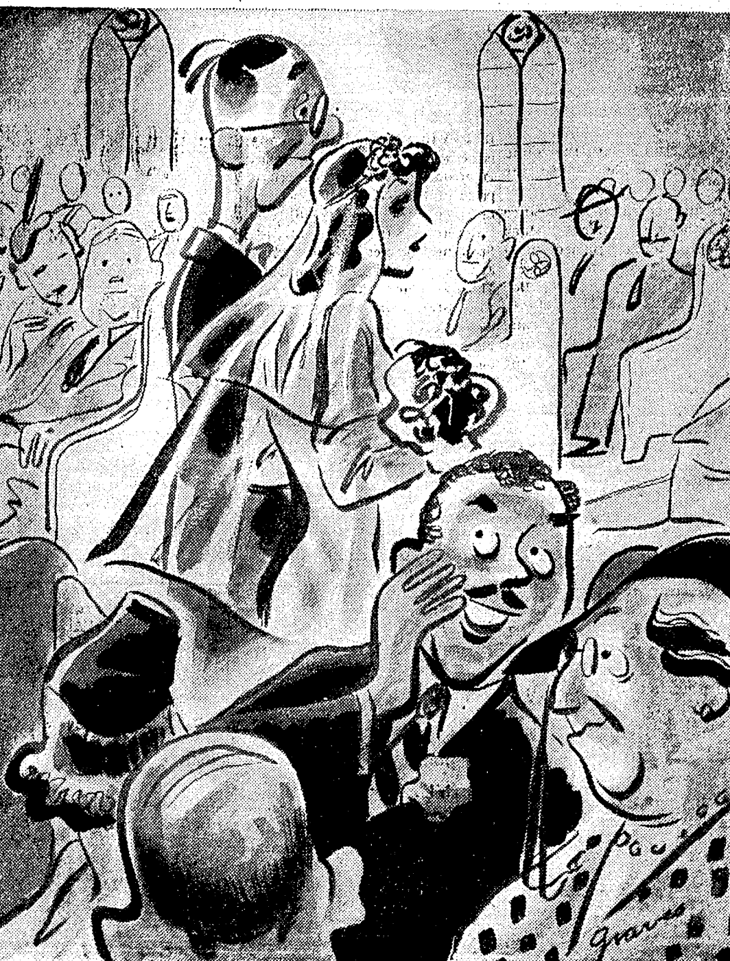
"It was his FORD V-8 that got her!"