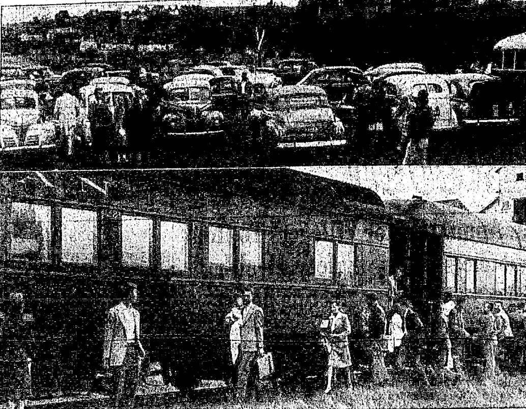
The 1947-48 school year was "officially" opened Tuesday noon when the student special arrived in Moscow. Dozens of friends with automobiles (upper photo) were on hand to greet the arrivals and transport them to the campus. The train brought students with their bags, baggage, and babies (lower).