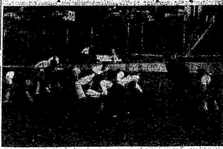
Campus club and Christmas hall teams battle to the first tie in the history of Idaho's intra-mural touch football program. After four quarters of rugged play the final gun sounded with the score: Christmas hall 0, Campus club 0.

And in the Coast conference games it's OSC over the University of Washington, Stanford over WSC, and UCLA over Idaho.