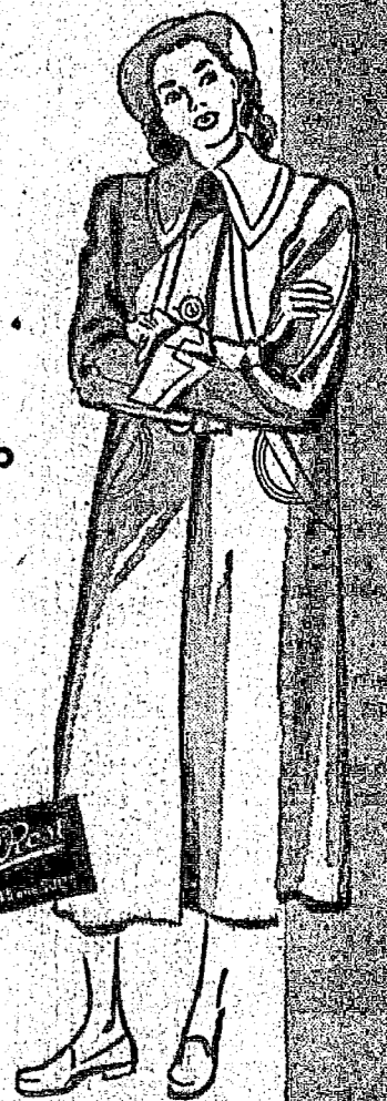
Sweeping Betty Rose casual with collar and cuff notched details. In new perspective! Pure wool Kingsbury covert. In grey, wine, green and brown. Sizes 10 to 20.