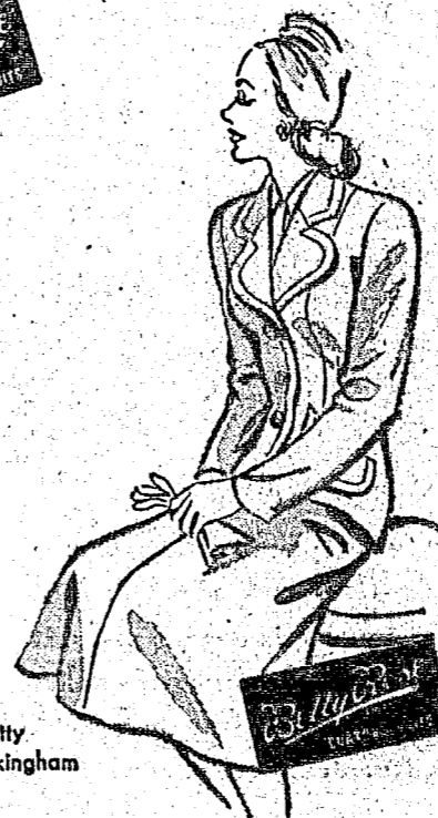
Handsome tailored Betty Rose classic suit of Buckingham pure wool menswear worsted. Grey, brown, oatmeal. Sizes 10 to 20.