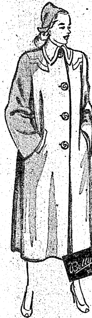
Gentle mannered Betty Rose casual coat with scalloped yoke details. Pure wool Queensbury covert. In wine, brown, green and black.

Be your own fairy godmother. Whisk yourself in to see our beautiful new Betty Rose coats and suits. Try them on... see for yourself, there's nothing better at near the price in coats and suits that do such magical things for your wardrobe.