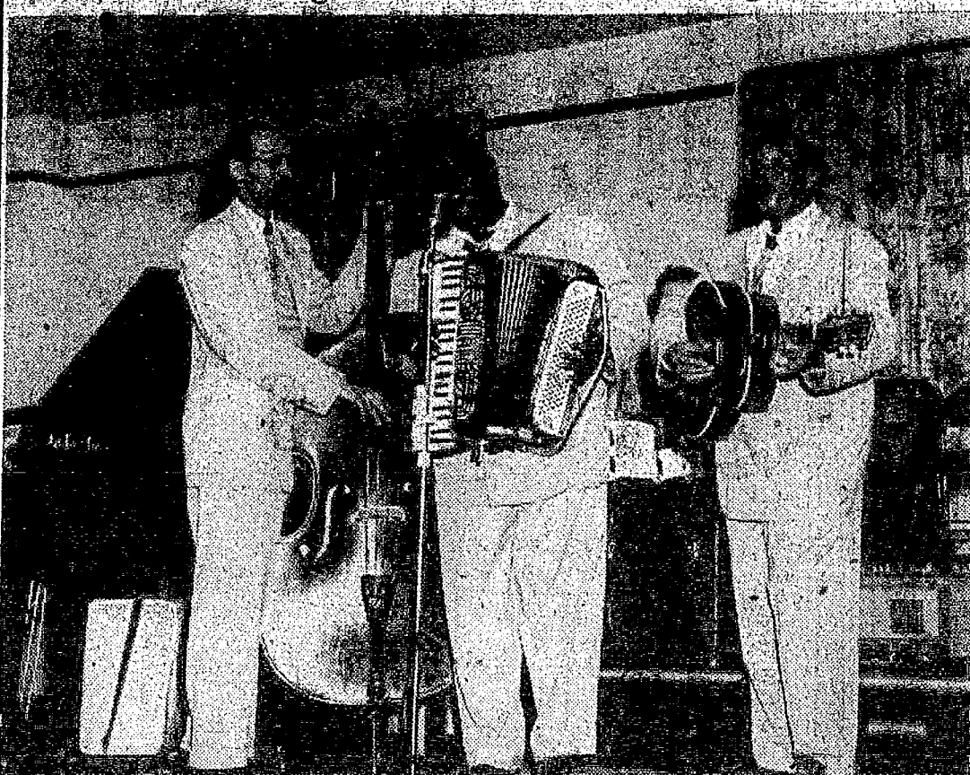
Pictured above giving their rendition of "It's Magic" are the All Baba trio during the Homecoming, kickoff dance which was held in the Bucket ballroom Tuesday afternoon. The trio is currently playing at the Athletic Round Table in Lewiston. The dance was a pre-Homecoming celebration during which time the queen contestants were introduced.