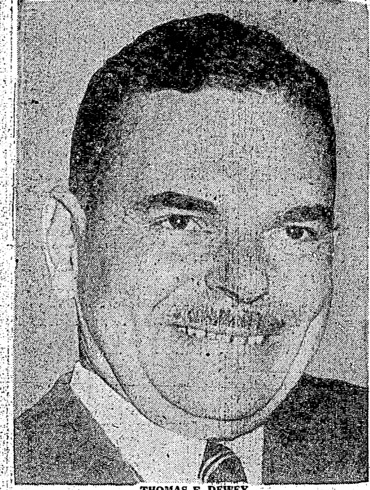
THOMAS E. DEWEY

National elections, carried out today in polls open all over the country will decide the leaders for the U. S. government for the next four years.