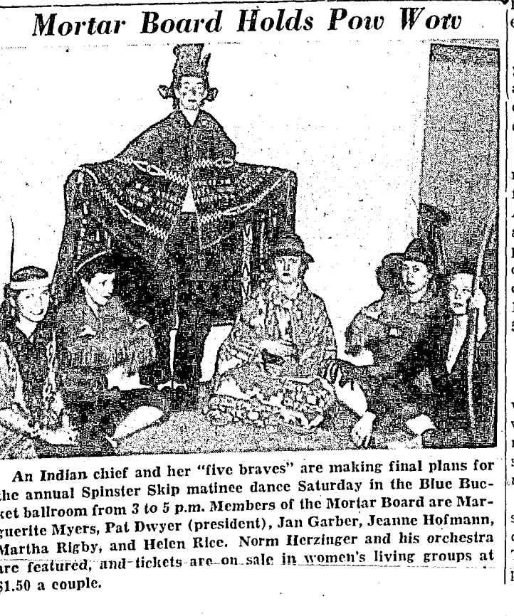
An Indian chief and her "five braves" are making final plans for the annual Spinster Skip matinee dance Saturday in the Blue Bucket ballroom from 3 to 5 p.m.

Mortar Board Holds Pow Wow An Indian chief and her "five braves" are making final plans for the annual Spinster Skip matinee dance Saturday in the Blue Bucket ballroom from 3 to 5 p.m.