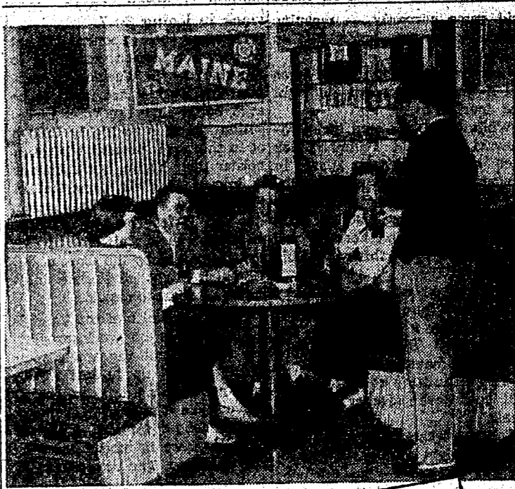
Snack Bar in Carnegie Library University of Maine Orono, Maine