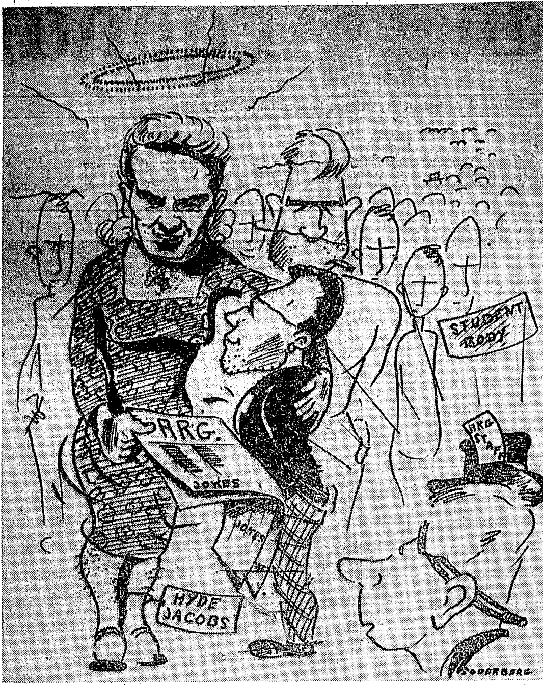
"My Boy, the Arg is Now Fit for You to Read."