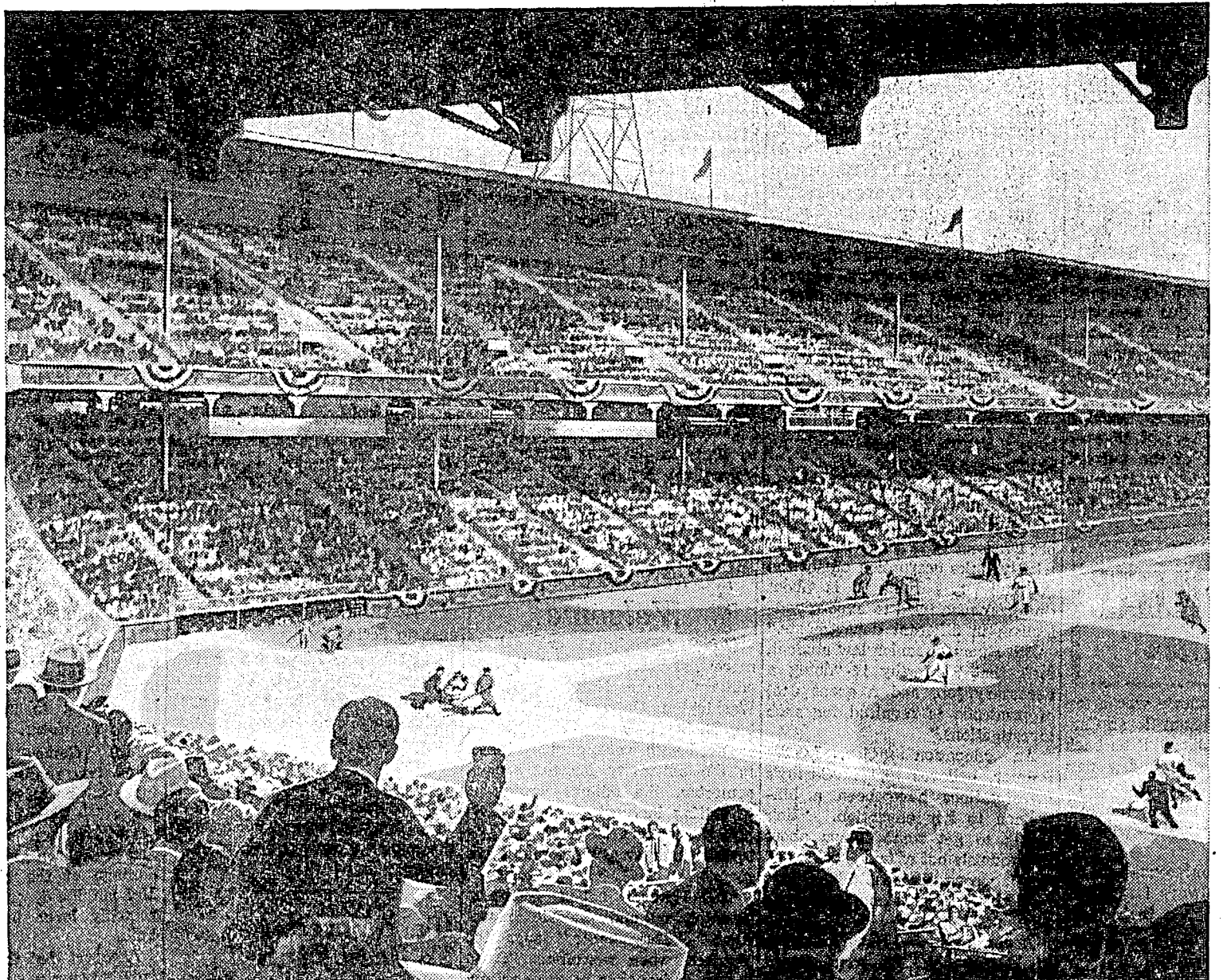
36,775 people—largest crowd ever to watch a World Series game in Ebbets Field—see Yanks beat Dodgers in the fifth game, October 4th, 1953.

SHIRTS • TIES • UNDERWEAR • HANDKERCHIEFS • SPORTSWEAR