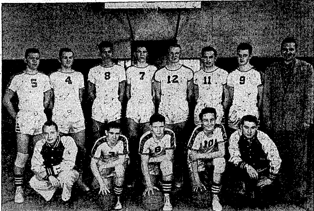
District one class B high school basketball champions who will be vying for a berth in the state tournament at Twin Falls March 19-20 are the Multonight in the first game of the four-game go-lan Tigers (top). The Tigers will meet Genesee round in Memorial Gym. Left to right (bottom