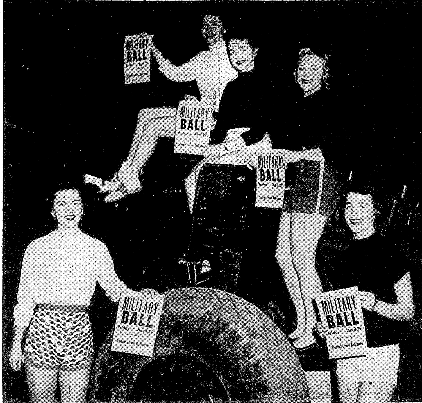
Don't guess, we'll tell you. They're advertising tonight's Military Ball. Incidentally, the babes above are the new feature for the 1955 dance. One of them will be