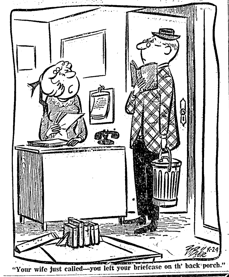
LITTLE MAN ON CAMPUS by Dick Bibler