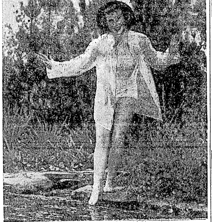
Everyone is Fluoridation conscious these days. Except perhaps the gentlemen who are looking at this picture of the lady testing the water for its content of fluorine.