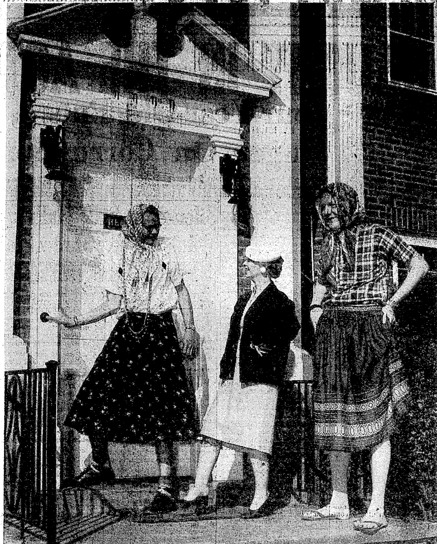
A trio of hopefuls assails the Quadruple Eta house while sisters of the sorority wait breathlessly just behind the door to see what this flock of potential pledges will be.