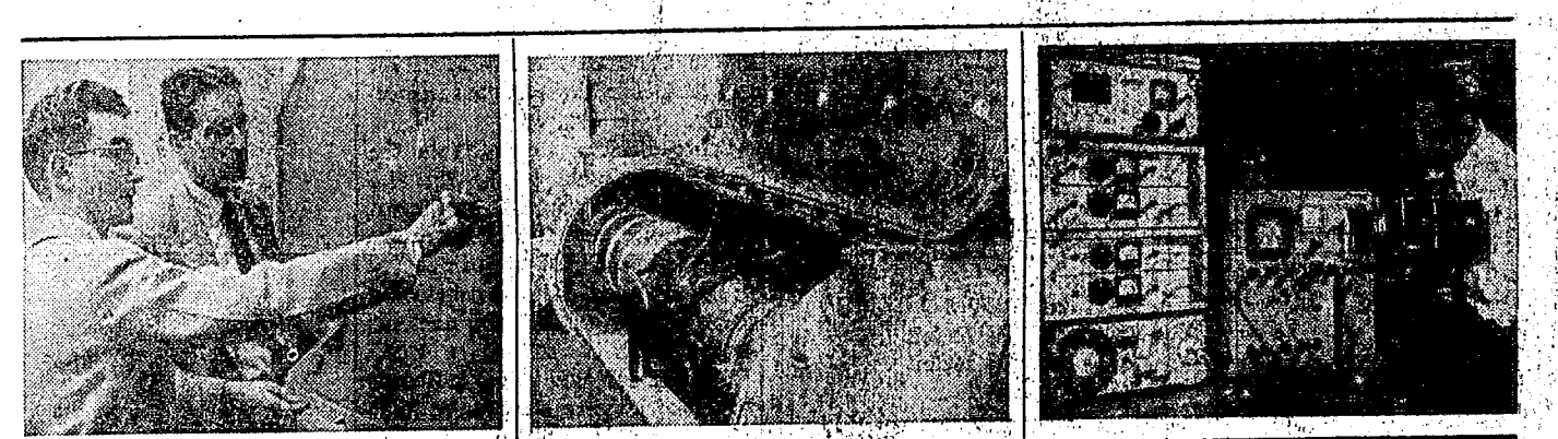
Several "summer profs" voluntarily spent part of their time conducting refresher courses for P & W A's young engineers. One assignment involved a comprehensive survey of equipment for the expansion of high-altitude test facilities in Willgoos Laboratory, the world's most complete, privately owned jet engine lab. Technical contributions were varied. Worthwhile assistance was given in vibration and instrumentation studies.

Though it was to be expected that both the company and the participating professors might benefit directly from such a program, the sphere of influence has been much broader. The many students who are taught by these professors during the college year are sharing the ultimate benefits... profiting from lectures that are sparked by the kind of practical experience that can be gained with a recognized industry leader like Pratt & Whitney Aircraft.