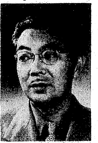
Dr. Hayakawa of his students were unable to express themselves aptly. Grammar Is Torture One conclusion he has drawn from his studies is that "grammar is an unnecessary form of torture which makes the majority of American adults nervous whenever they pick up a pen." He believes that these are merely incidentals and that the main thing is to be understood and also to understand. Hayakawa was born in Vancouver, British Columbia in 1906. He received his bachelor's degree at the University of Manitoba in 1937 and his master's a year later at McGill University in Canada. He came to the US in 1929. At one time he criticized Dr. Mortimer Adler and Dr. Robert M. Hutchins for spending too much time thinking about abstract subjects. He advised them to get their minds out of outer space and study something useful. Adler Will Speak Here Adler will speak here March 27. Hutchins spoke here two years ago on modern education. General semantics is a term that was first used by Alfred Korzybski to define a new field of communications. This study deals with the explicit meaning of words and the reaction of people to different sounds and words. Hayakawa took up general semantics where Korzybski left off and was instrumental in developing it to where it is now.