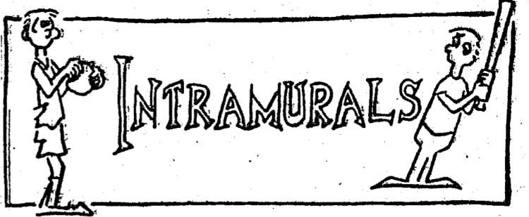
Table tennis joined bowling and 'B' basketball on the intramural scene last night with six singles games going into the books. Results of the games were unavailable at press time. Singles play is scheduled to be completed March 28, while doubles play will finish with the championship game March 22. Dates were set for spring golf and track action, golf slated for May 7, and track set for April 23 and 25.