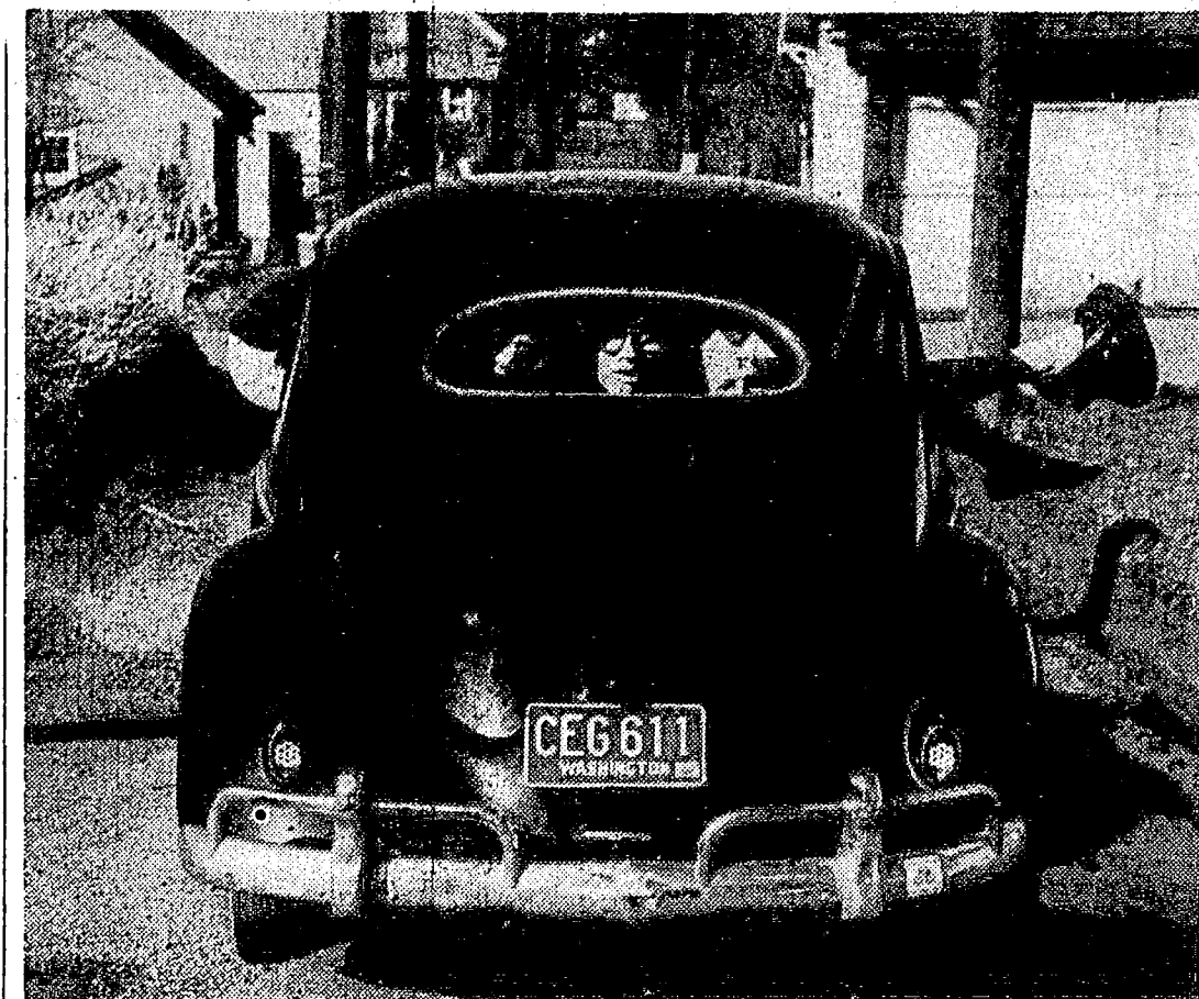
ON TO LAUDERDALE! — 16 men and one Volkswagen disembark from the campus on their way to the national Phi Kappa Xi convention at Fort Lauderdale. The rather unorthodox legs appearing out the window, no doubt belong to a future "Wondergirl of PKX."