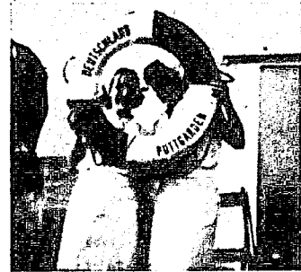
Make your trip to Europe pay for itself.

Alpha Zeta, agriculture honorary will meet Thursday night at 7 p.m. in the Cataldo Room.