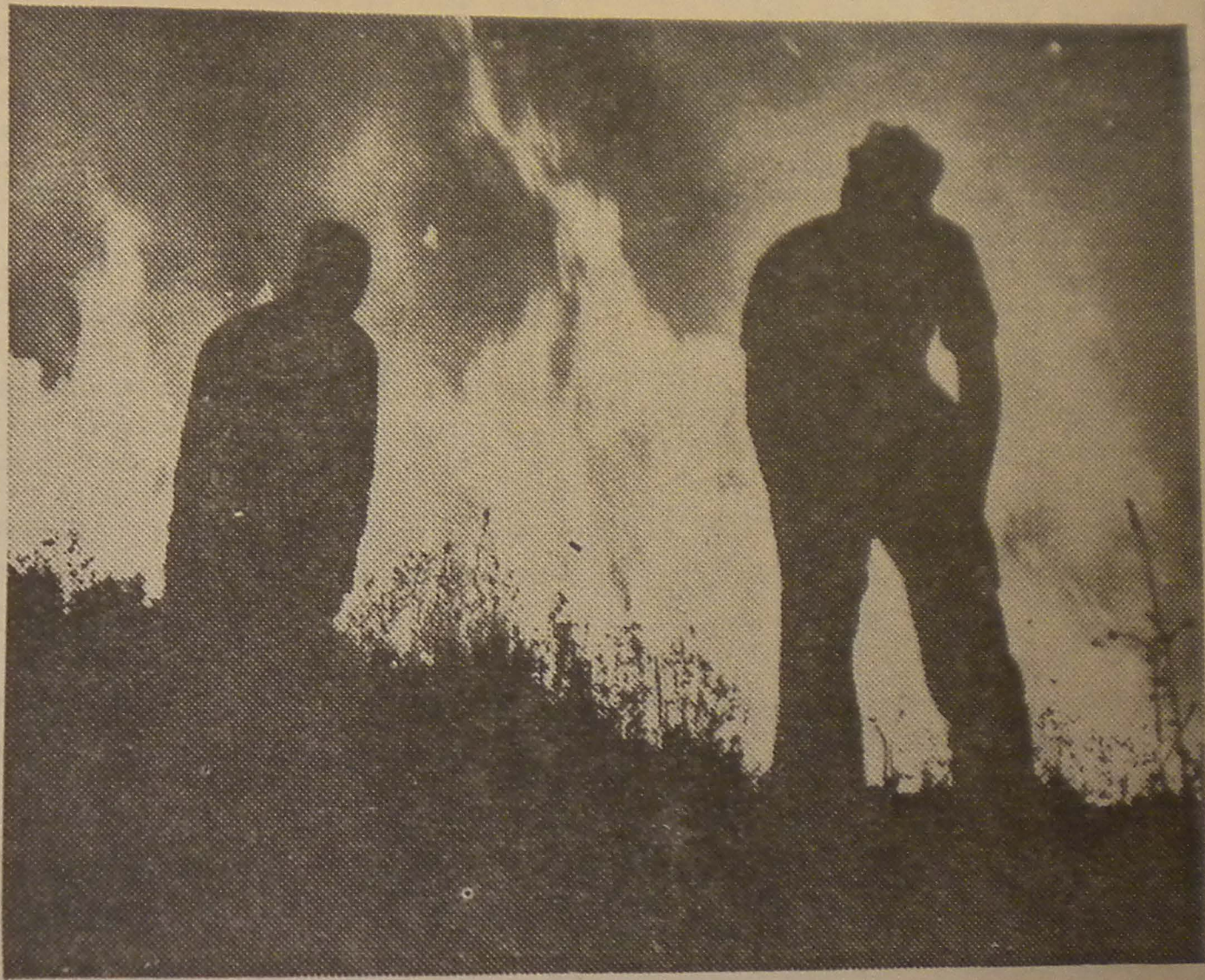
ABOVE —Silhouettes of service, two CCC youths fighting a forest fire. RIGHT —New enrollees leaving for camp. There

Today, as some 250,000 youths in almost 1,500 camps celebrate the sixth anniversary of their benefaction, CCC has hit rough waters. By the time congress adjourns this least criticized of all Roosevelt agencies may either be sentenced to death or changed into a semi-military army of unemployed youth.