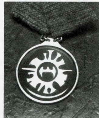
The first President's Medallion created in 1965.