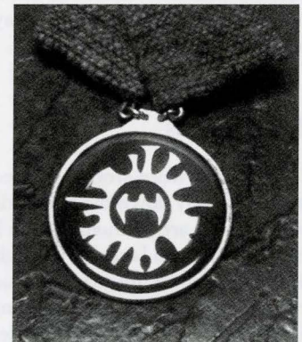
The first President's Medallion, created in 1965.