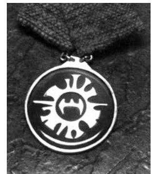
The first President's Medallion, created in 1965.