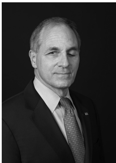
Louis J. Freeh

Louis J. Freeh advises senior leaders of global companies and governments on complex investigative, governance, compliance, and regulatory matters. Since leaving government service, Louie has been appointed by courts, corporate boards and governments to help the world's largest companies navigate legal and compliance issues related to the Foreign Corrupt Practices Act (FCPA) and similar anti-corruption regulations. Louie's firsthand experience with U.S. judicial, law enforcement and regulatory agencies, national governments, and leaders of global businesses allows him to assist organizations in navigating crisis situations and complex, multi-jurisdictional matters quickly and strategically. His expertise and leadership qualities advise and support boards, governments and CEOs on a range of sensitive undertakings including investigations and enhanced due diligence, litigation strategy, compliance monitoring and assessments, and liaison with regulatory authorities.