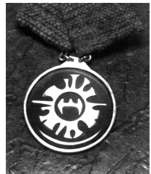
The first President's Medallion, created in 1965.