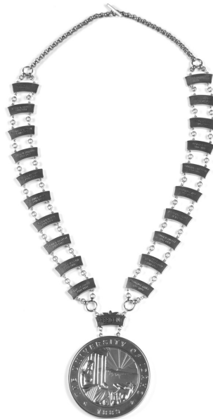
The university's second, and current, President's Medallion.