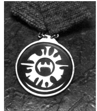
The first President's Medallion, created in 1965.