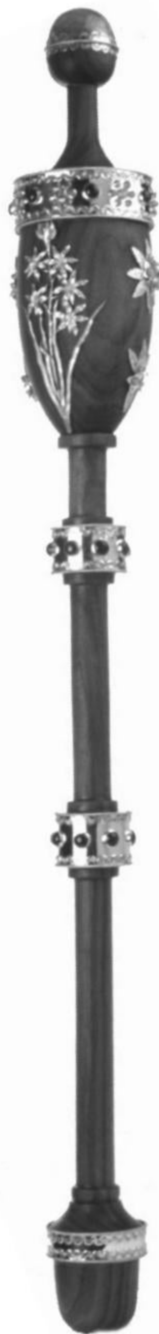
University of Idaho mace

The University of Idaho's mace, used for the first time at the centennial commencement, is 32 inches long, made of walnut and encircled with bands of Idaho gold and silver in which Idaho garnets and opals have been inlaid. The head is embellished with silver and gold representations of camas plants and syringa flowers. The chair of the university's Faculty Senate, the marshal of the academic procession, carries the mace in the American tradition, at a 45-degree angle across the chest, while in England, the bearer carries it over the shoulder.