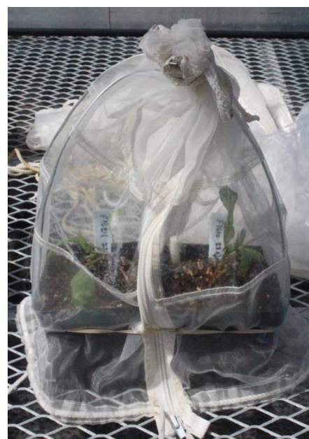
Fig. 2.3. Insect cage with sugar beet used in paired choice experiments.

A non-continuous rating scale from 0-3 was used in these experiments. A damage rating of 0 indicated that there were no observable scars or evidence of feeding on the sugar beet by maggots (Fig. 2.2-A). A rating of 1 indicated that there was evidence of feeding damage in the secondary roots with no observable damage to the primary or tap root (Fig. 2.2-B). A score of 2 indicated evidence of feeding on the tap root with between one to three noticeable black feeding scars (Fig. 2.2-C). Finally, a rating of 3 indicated four or more feeding scars or a complete severing of the tap root by feeding (Fig. 2.2-D).