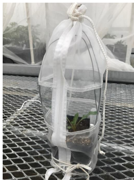
Fig. 2.1. Insect cage with sugar beet used for rearing and no-choice experiments.

For these assays, sugar beet variety BTS 27RR20 (BetaSeed, Inc., Shakopee, MN, USA) was used; this variety exhibits strong resistance to rhizomania, Fusarium root rot, and beet curly top virus and produces high yields of estimated recoverable sucrose, but is susceptible to sugar beet root maggot feeding (BetaSeed, Inc. 2016). Two beet seeds were planted in pots that measured 10 × 10 cm wide by 9 cm tall. After beets had germinated, they were thinned to one plant per pot. Beets were watered every three days until three weeks after emergence at which point they were watered every other day. Plants