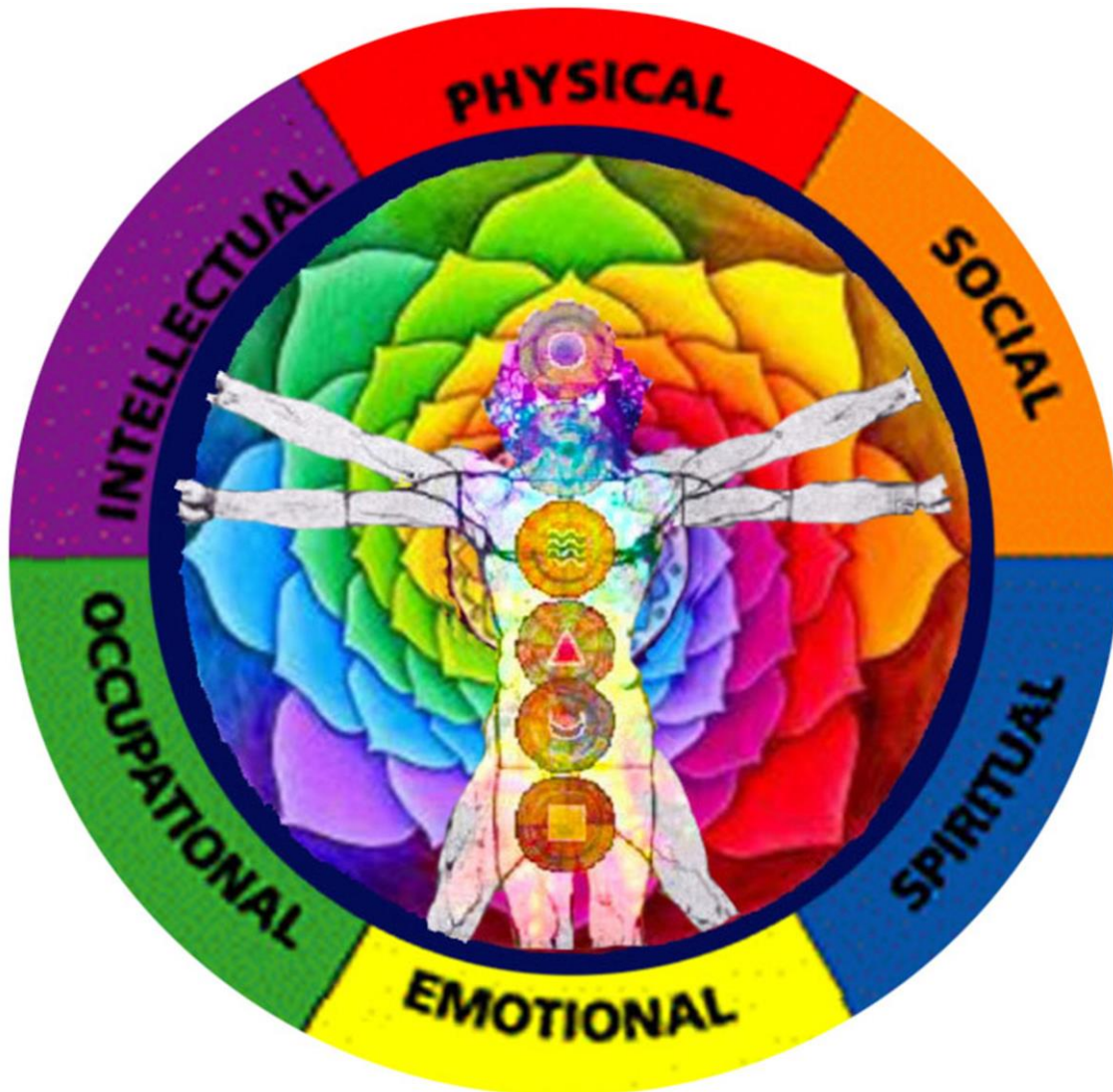
Figure 3. 1

Note: Graphic created using Adobe Photoshop by Peg Hamlett, utilizing the Da Vinci Vitruvian man overlaid with energy chakras and the lotus spectrum.