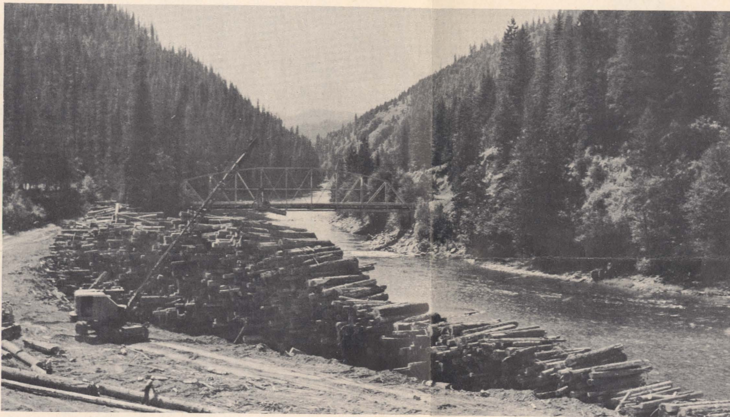
TIMBER—MINERALS—WATER—FISH—WILDLIFE—EMPLOYMENT—RECREATION Access made possible by Logging Roads.

P. F. I.'s Camp T Landing on North Fork of Clearwater River in the heart of Big Game Hunting Area. Logs Decked for Annual Spring Drive to Lewiston