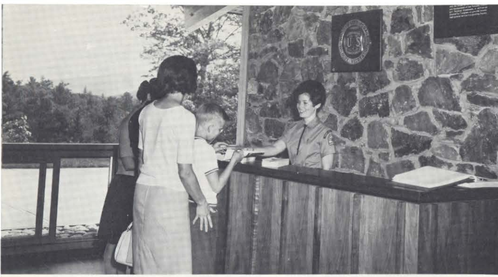
Visitor Information Center at Cradle receives thousands of visitors daily