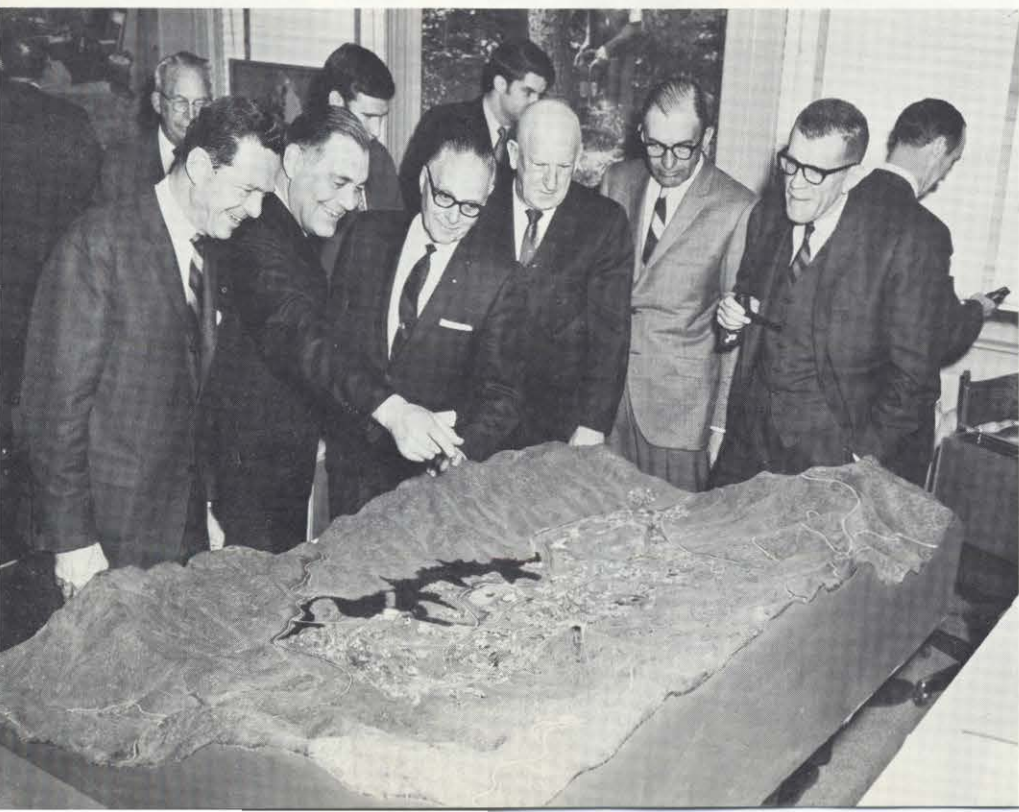
Members of AFA's Board of Directors view future plans for Cradle of Forestry