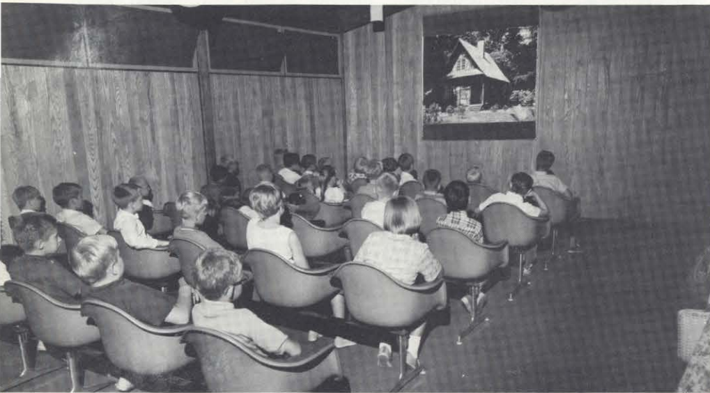
Films on history of forestry in United States are shown daily at Information Center