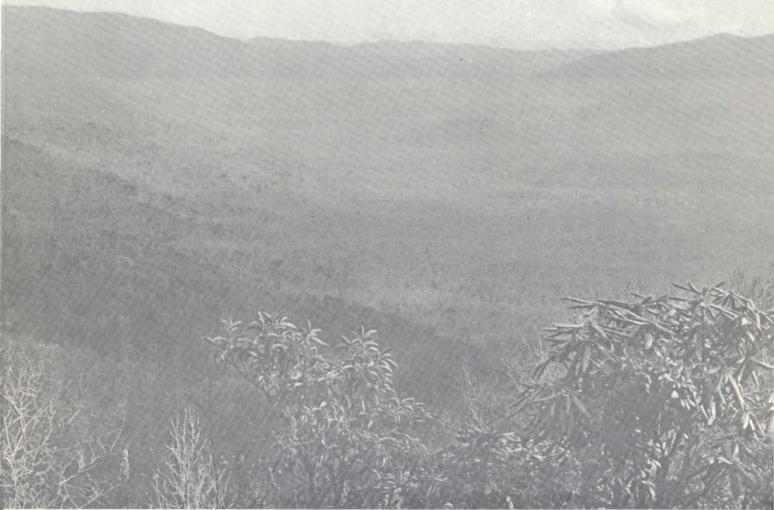
Pink beds of the Cradle of Forestry where first scientific forestry in America was practiced, near Asheville, North Carolina