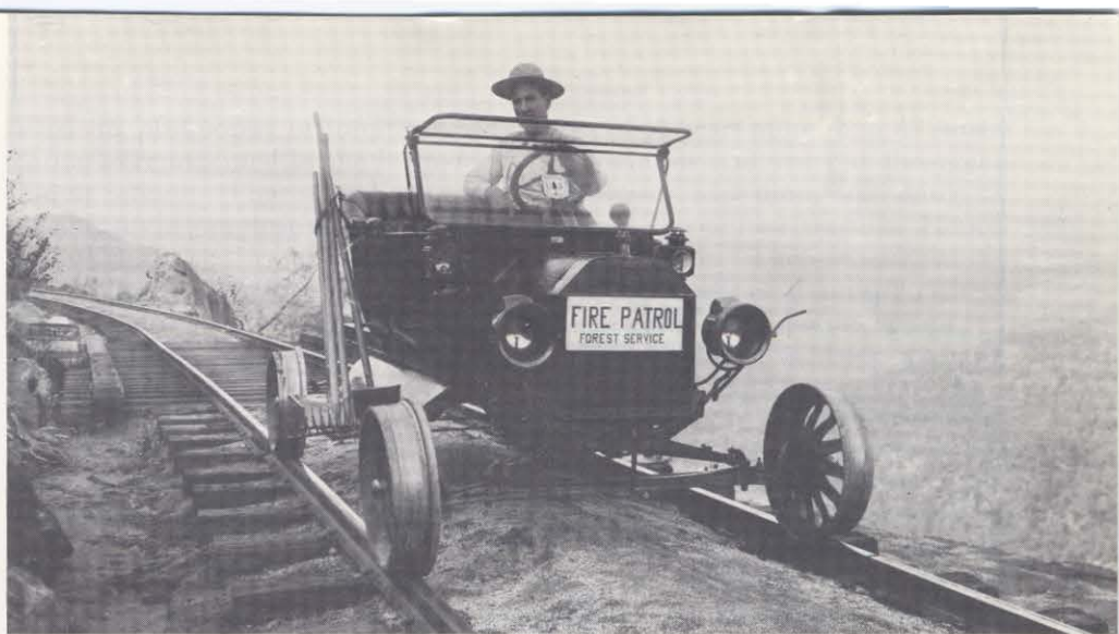
Fire patrols were needed because of mountaineers' practice of burning to clear land