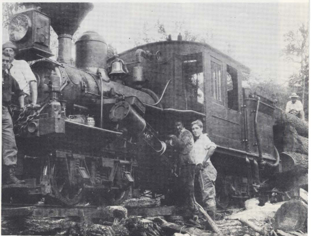
Small railroad was constructed on Biltmore forest to haul logs from forest to market