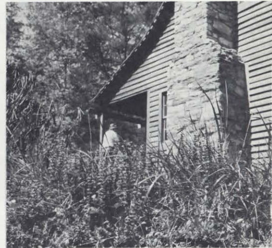
Another restored cabin for benefit of visitors to Cradle, this one is typical of Appalachian mountaineer style homes