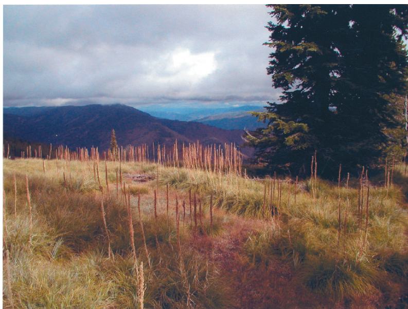
No See-Um Butte

All in all, the one defining word for this trip would be “memorable.”