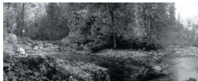
Sheep Creek in the River of No Return Wilderness

Layout: Kelley Racicot