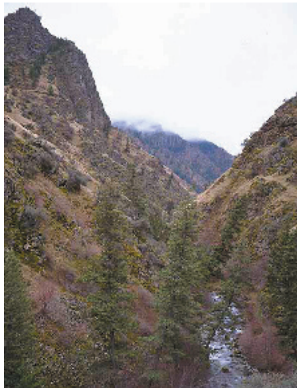
Rapid River Canyon

Through our field glasses we could make out elk feeding in the open meadows facing us on the western ridge. They remained in close proximity to the sparse pine stands that dotted the otherwise grassy slope.