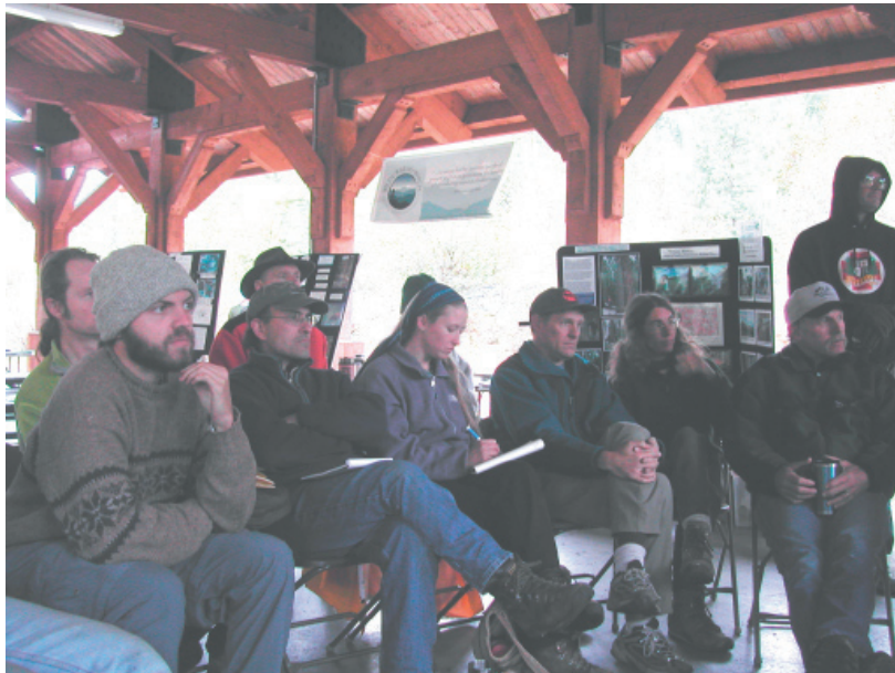
Rendezvous 2005 participants, warm and wild

The late September rain kept coming down harder and harder, and it got progressively colder, and we all had a great time at the 2005 Wild Rockies Rendezvous, Sept. 23-25 at Wilderness Gateway campground up on the Lochsa river, about halfway between Lewiston and Missoula on Hwy. 12. Plenty of good news to