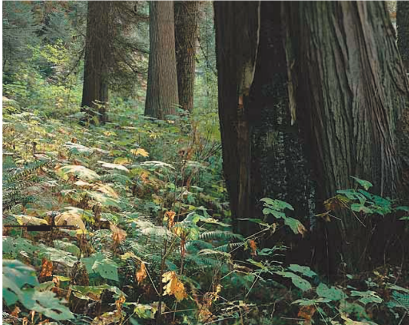
Old growth Western red cedar in Meadow Creek, NPNF

The second case, filed by the Idaho Conservation League and Friends of the Clearwater on the Whiskey South Timber Sale in the South Fork Clearwater. We were represented by Advocates for