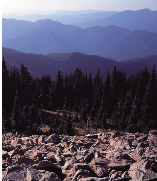
The Mallard Larkins roadless area, in Clearwater County, is one of the many gems threatened by Bush’s roadless rule repeal

We will be working hard over the next few months making decisions about how to get our group’s mission off the ground. Look for more information about the [Wild Clearwater Business Group-We haven’t named it yet.] in coming issues of the Clearwater Defender. If you are a business owner and would like to get involved, please feel free to contact me at ja@moscow.com . There’s power in numbers.