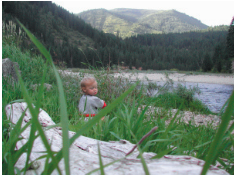
Life on the Lochsa, as it should be