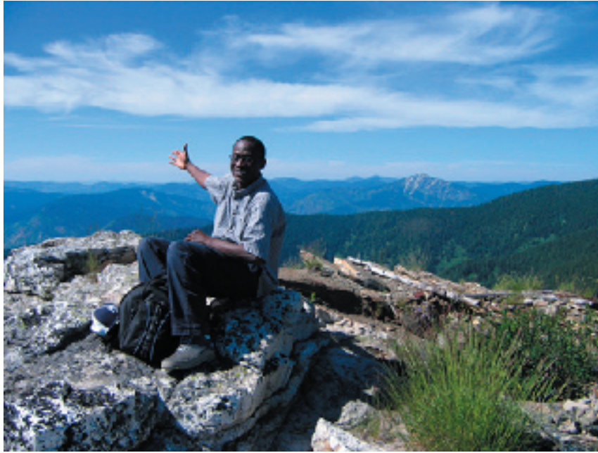
Mallard's View

derness and wild nature keep two very important balls in the air simultaneously. On the one hand we need to keep doing what we are good at doing, namely advocating for conservation values, for wilderness, for sensible management of public lands, and insisting that the Forest Service and other public agencies follow the law all the time, and not just when it's convenient to do so. We need to keep making noise, speaking on behalf of places and creatures that cannot speak for themselves. But we also need to be as mindful as possible of the bigger context in which our efforts and battles are taking place.