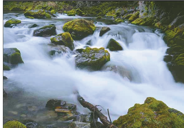
Rapid River, unprotected roadless country just east of Hells Canyon Wilderness

6) Roads of any sort in the very limited geographic range of the primary host provide a