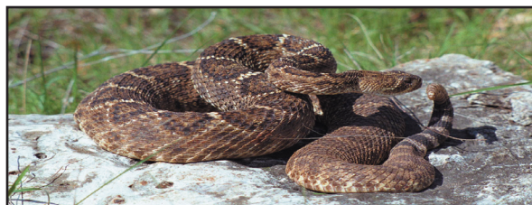
Western Rattle Snake, file photo