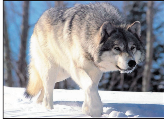
Gray Wolf, WERC

On another note, Idaho's anti-wolf coalition failed to get the required number of signatures to put an initiative on the ballot making it state policy to remove all of the wolves in Idaho. It has been