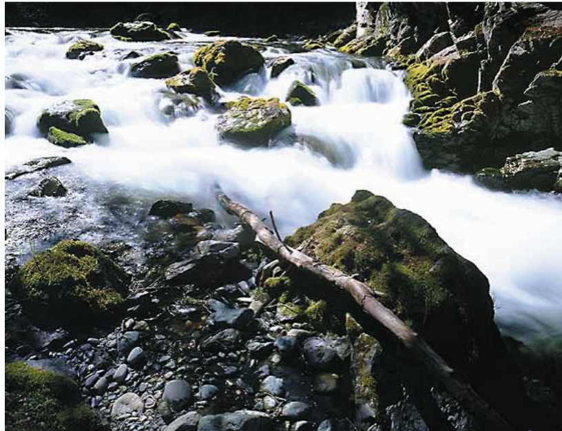
Rapid River, roadless country in the Nez Perce NF