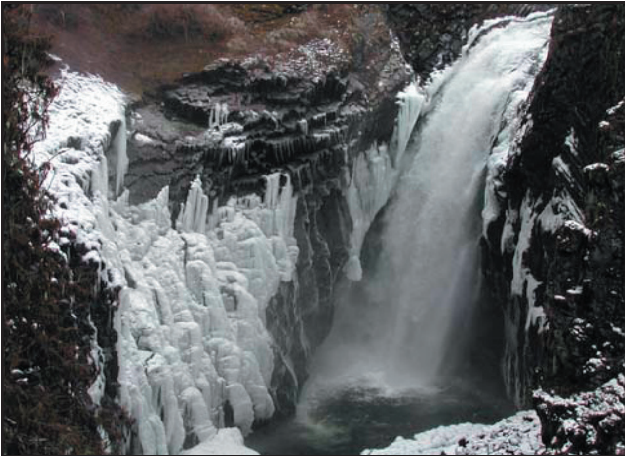
Lower Elk Falls

Some 14 percent of all runoff comes from the roughly 190 million acres of our national forests, which take up only eight percent of the land. According to the Environmental Protection Agency, more than 60 million people in 3,400 communities in 33 states rely on national forests for their drinking water. Millions more depend on state