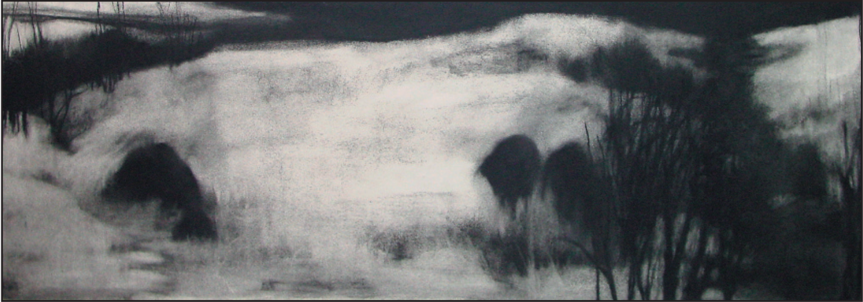
Creek, charcoal by Elaine Green