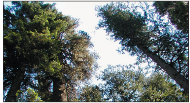
White pines at Cedar Creek, file photo

Poignant, but an admission of guilt? Unless