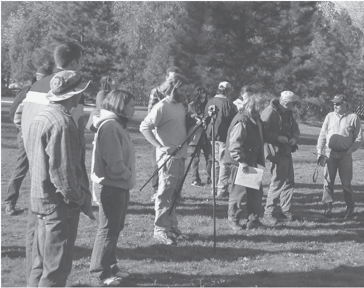
Volunteers gathering for a monitoring project