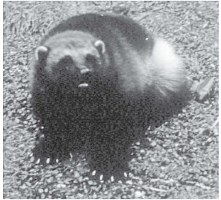
Wolverine (Gulo gulo)

Wolverines, already suffering in the U.S. from trapping, habitat loss, and other human actions, are especially vulnerable to the effects of global warming because they depend on deep snow for everything from travel corridors to snow dens where they raise their young. The species once roamed across the northern U.S. and as far south as New Mexico and southern California. Now wolverines have been reduced to small, fragmented populations in Idaho, Montana, Washington, and Wyoming.