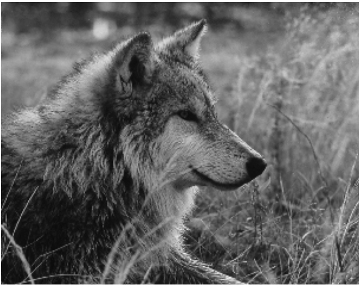
Gray Wolf (Canis lupus)