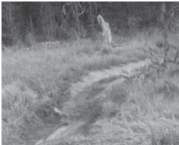
Off-Road Vehicle Damage to Meadow Creek Roadless Area

The Forest Service heard from many citizens during the scoping period for their proposed land exchange in the upper Lochsa drainage. Even the state legislature reported an interest in how the exchange was being pursued. Another opportunity to comment will arise when the agency produces a DEIS on this scheme to trade scattered public lands in three national forests for private, railroad-grant tracts around the Lochsa headwaters that should have reverted back to public ownership decades ago. See the Big Wild Bi-Weeklies for fall 2008 on the FOC website for more information or visit the Clearwater National Forest website for the exchange proposal and accompanying maps.