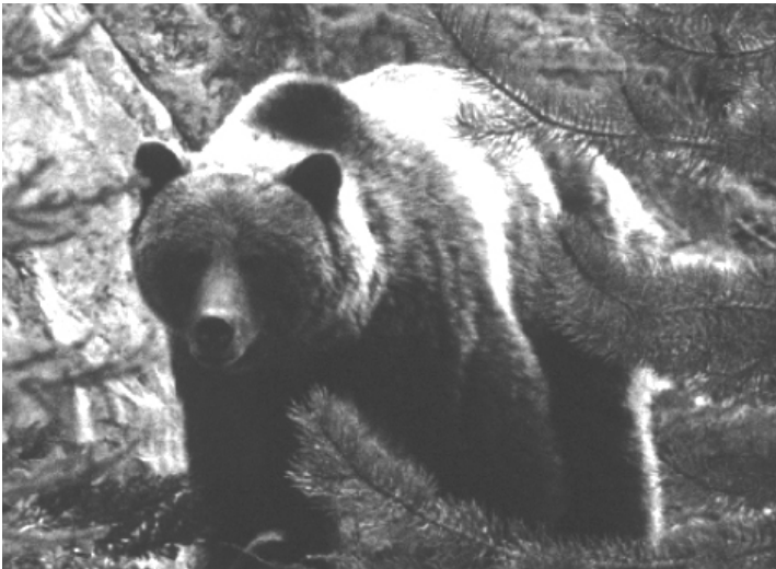
Grizzly Bear (Ursus arctos horribilis)

As interesting as this search may be, it is largely a distraction from what should be the main goal – to decide what to do with a plan that was approved eight and a half years ago to reintroduce grizzlies into this area. The Selway-Bitterroot is one of six areas designated by the Interagency Grizzly Bear Committee, a group of state and federal wildlife officials, for recovery of grizzly bears under the Endangered Species Act. Uniformly, biologists agree that a viable population of grizzlies in the Clearwater basin would go a long way toward saving the great bear. The Bitterroots could stitch back together the remnant populations that remain in Yellowstone to the southeast and in the Cabinet Mountains to the north. Two of the greatest threats to any endangered species are habitat fragmentation and genetic isolation.