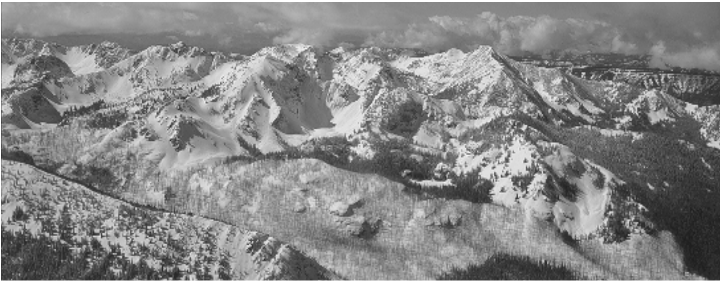
Idaho Wildlands