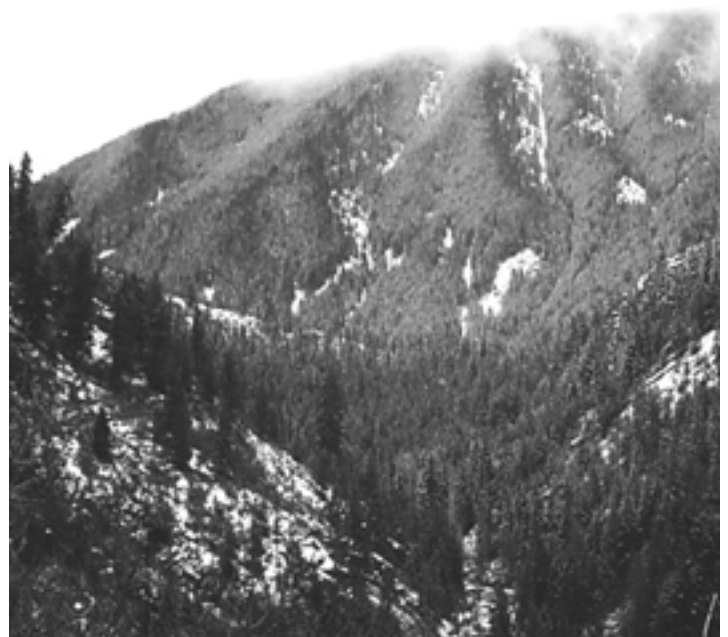
Winter in the Selway-Bitterroot Wilderness