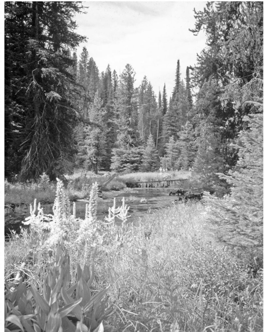
Meadow Creek Roadless Area

Thanks to all who attended the Friends of the Clearwater 2009 Annual Membership Meeting.