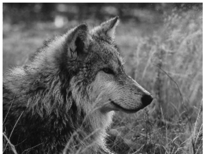
Gray Wolf (Canis lupus)

Attitudes of the populace will evolve over time, but it is the young and innocent hearts of children where hope lies. Wolves do not attack humans. Let's be sure the children know the truth.