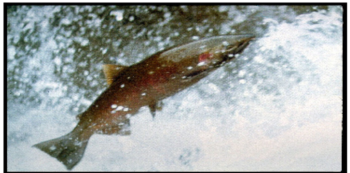
Steelhead are Returning to Clearwater Country

Methodology proposed by the Montana Department of Environmental Quality was used in the biomonitoring analysis of Larson Creek. The stream ranks 81 percent of the maximum, which means "full support" regarding water quality standards.