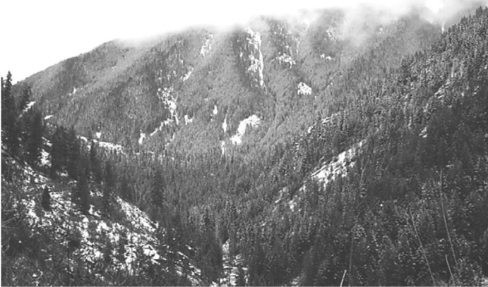
A Mild Winter in the Clearwater Basin

BI-WEEKLY E-MAIL UPDATES ON THE PLACES YOU CARE ABOUT: YOUR PUBLIC LANDS!