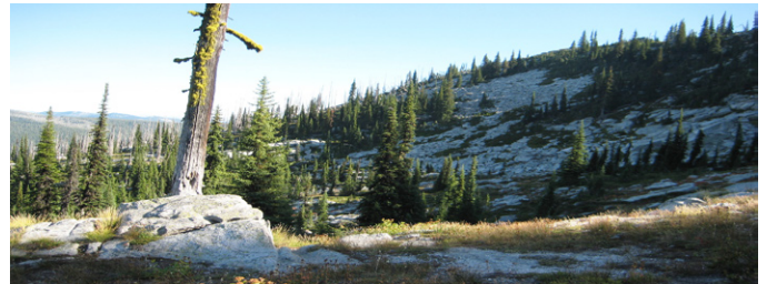
Selway-Bitterroot Wilderness

If the two forests are formally combined, it would be around four million acres in size. That is massive. We will keep you updated on this issue.