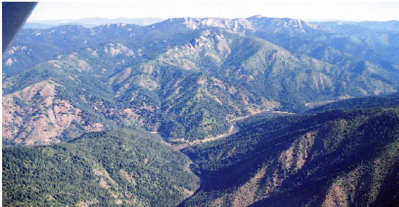
Weitas Creek meets North Fork of the Clearwater