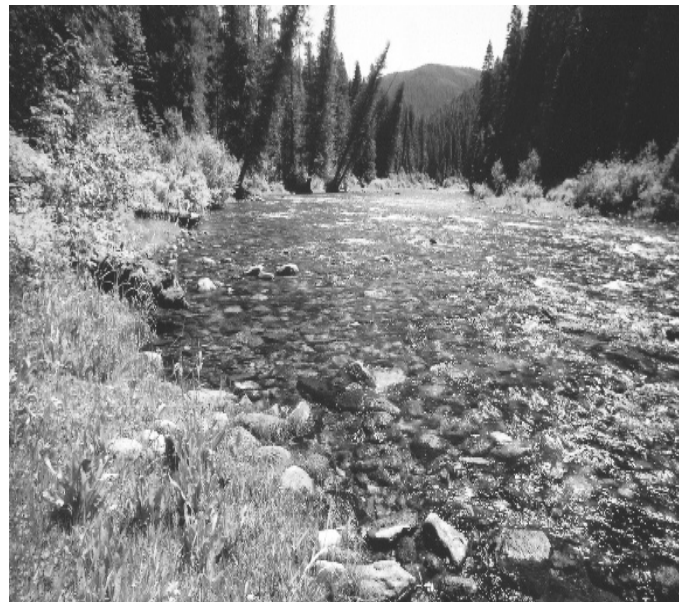
Weitas Creek Roadless Area is 260,000 acres

It was one thing to expand their constituency with new “messaging” about wilderness (it was reported in 2003 that the Pew Trusts were spending more than a million dollars a year on opinion surveys and media campaigns) but there was much more to the groups’ work with communities. They were learning that if they gave something up—more trees to be cut, more off-road vehicle areas, public land traded, sold, or given away—they could mollify anti-Wilderness interests, slap together so-called “win-win” deals, get members of Congress to sponsor their proposals, and put more wilderness acres on the