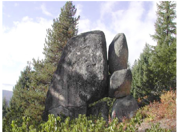
Pot Mountain Roadless Area is 50,000 acres

The average stream width from the two reaches we measured was 26.3 feet, while the average depth was 5.9 inches with a width/depth ratio of 53.5. The average rate of stream flow was 13.9 meters/sec. It is