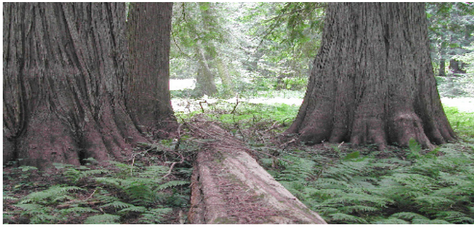
Giant Cedars in Clearwater Country