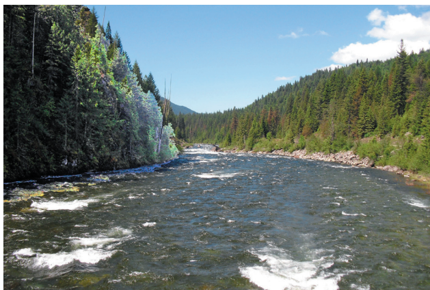
N. Fork Clearwater Spring Run Off

Thank You New-Land Foundation & River Odyssey West For Helping FOC Defend the Wild Clearwater Country!!