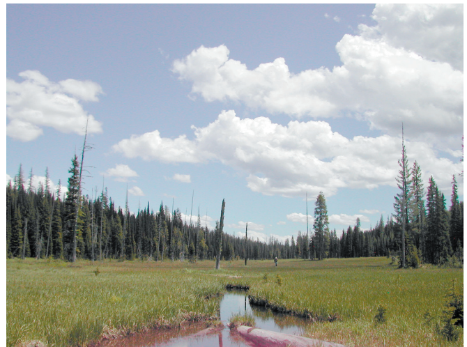
49 Meadows Near Avery, Idaho

Presently, FOC is proposing Fortynine Meadows, headwaters to the Little Nork Fork Clearwater River, as an RNA since twenty three years ago Chuck Wellner was not able to provide RNA protection to this subalpine peatland. The narrow 400-acre meadow contains a low-gradient, meandering stream fed by side inlets of spring origin. Periodically, beavers have occupied the site, at which times they have rebuilt dams, raised the water level and exhausted the food supply. Moose are commonly seen together with wolf sign. The site is one of the best examples of peatland ecology in the Northern Rocky Mountains where mild, wet winters prevail. Due to its easy accessibility, Fortynine Meadows provided an excellent opportunity this summer for research and teaching.