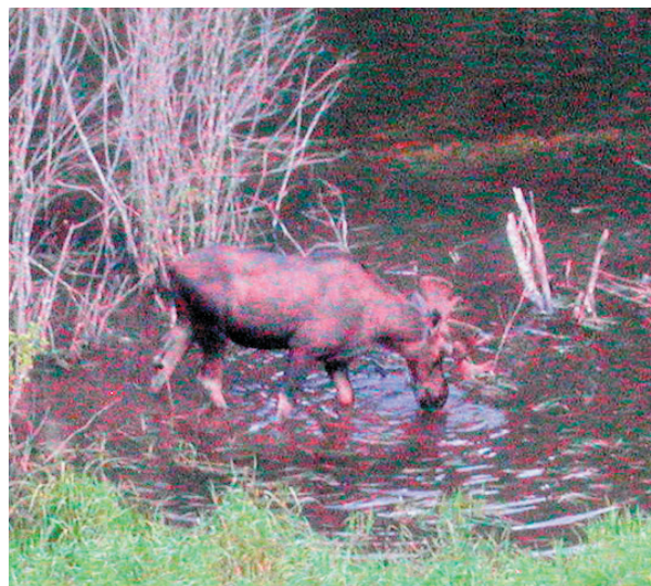
Bull Moose Feeding Along Weitas Creek

On the last day of my second trip, I found myself dripping wet, sore and in need of a rest. The rains had finally passed, the skies had begun to darken and it was time for a hot meal. Sure enough, I was not the only one with food on my mind. About fifty yards below the trail, my eyes honed in on a bull moose feeding in one of the lush pools adjacent to the river. Minutes later a bull elk and cow emerged from the west bank of Weitas Creek and peacefully crossed the waters into a meadow of grasses and wildflowers. I remember thinking how special it all was and how there are not too many places left in the lower 48 where you can feel such wildness on the winds and freedom in your soul. No, I was not in Alaska, but instead smack dab in the middle of wild Clearwater country. The Forest Service needs to keep the motors out of this place and the Bighorn-Weitas roadless area needs to be designated Wilderness. It's as big and wild as it gets!