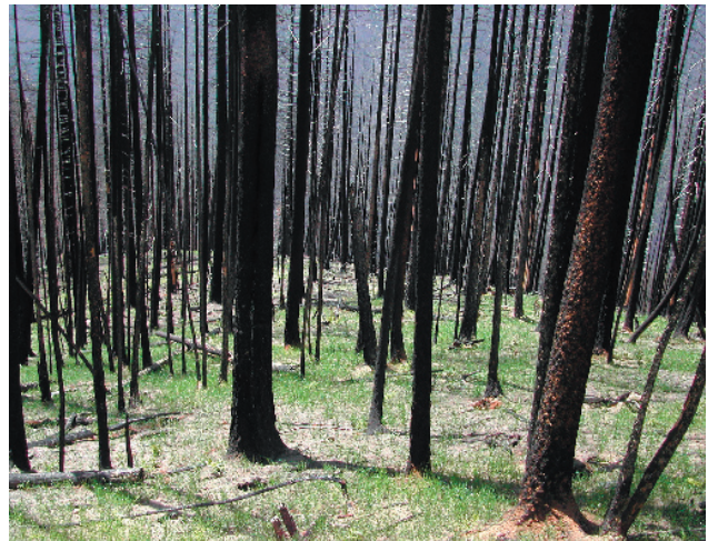
Wildfire Is A Part Of The Clearwater FOC File Photo

The main concern I have with all three books is that they all overstate, to varying degrees, the historic/ecological significance of milder fires and pre-European anthropogenic burning in this part of the Rockies, at least according to the most current science. This provides a good segue, from the history to fire ecology. Three recent books are very illuminating and help correct some of the misperceptions about fire in this part of the Rockies.