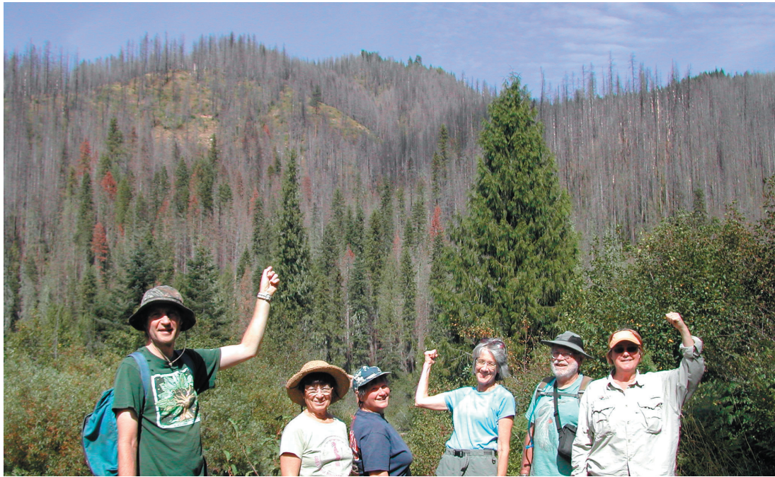
Post-Prescribed Fire Monitoring in Weitas Creek