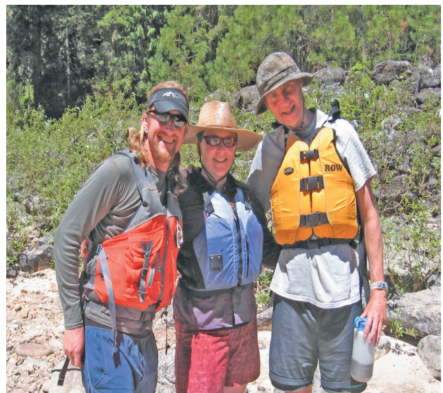
1st Annual Clearwater River Rendezvous