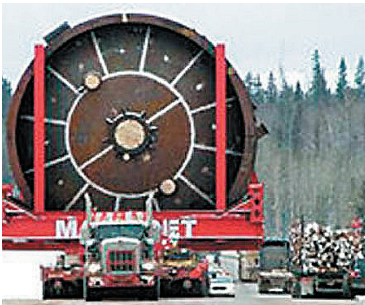
Big Oil Threatens the Clearwater Basin

According to Forbes Magazine, ExxonMobil posted net profits in 2007 of $42 BILLION. In 2008, their net profits climbed to $45 BILLION. And as ExxonMobil spokesperson Ken Johnson publicly admitted in Kooskia on June 29, 2010, a single reason exists for the choice of