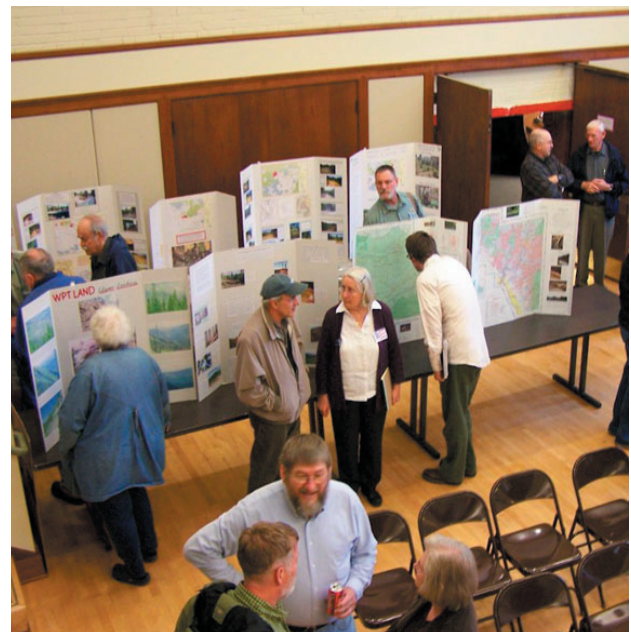
The Public Weighs in On the Exchange Moscow Cares Photo

Now who's dumb enough to hold their breath on that one?