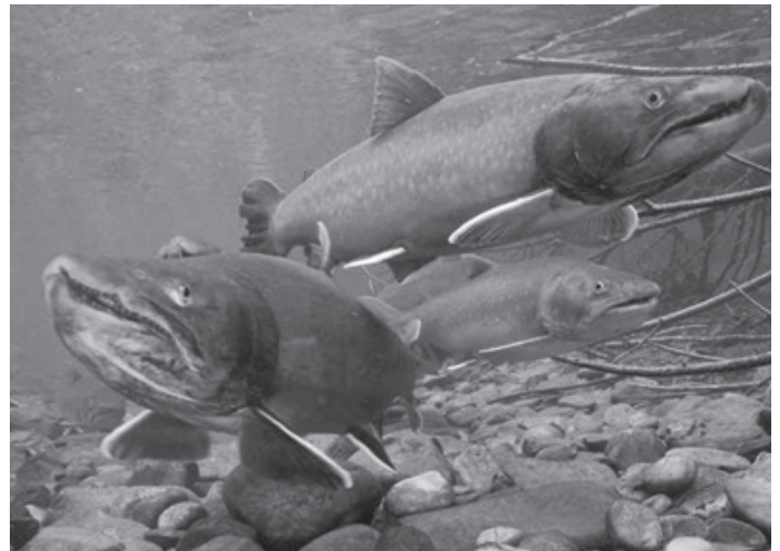
Bull Trout Like It Cold & Clean