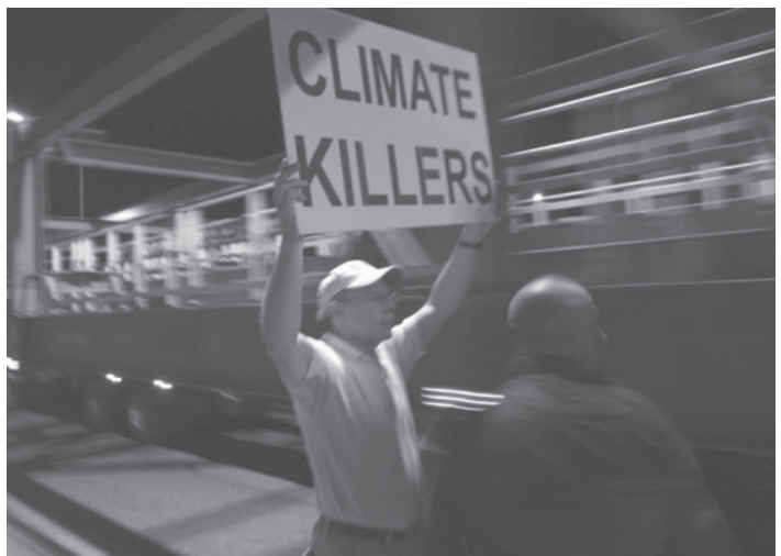
Tar Sands equals climate disaster

Believe It or Not You Can “Like” Us On Facebook Breaking News Community Events Wild Clearwater Pictures