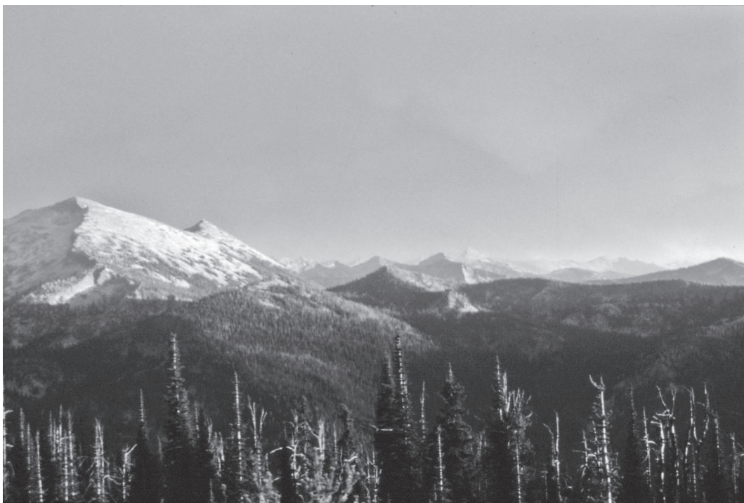
Ranger Peak, Selway-Bitterroot Wilderness