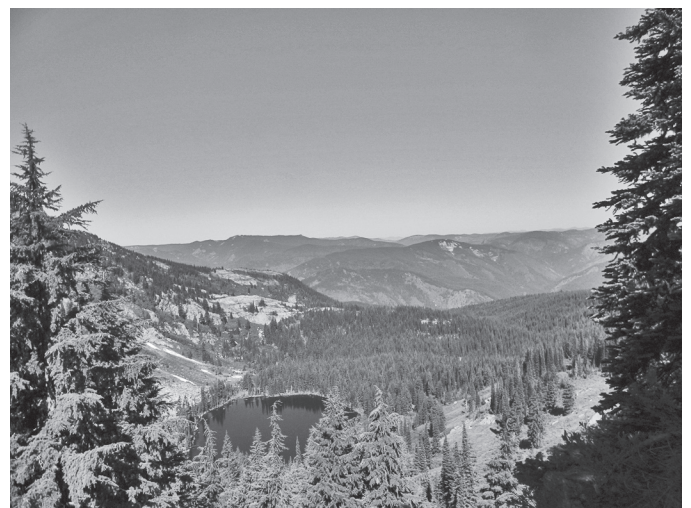
Larkins Lake Looking West