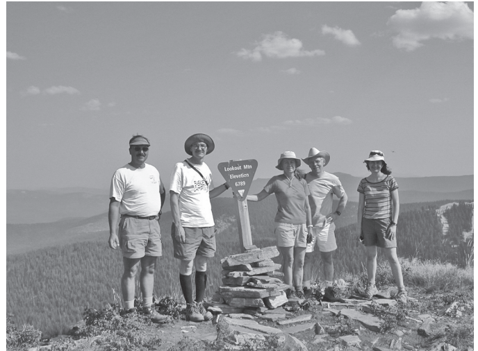
The Lookout Mountain Crew

– 9:00pm at the 1912 Center. Cookies and eggnog will be provided.