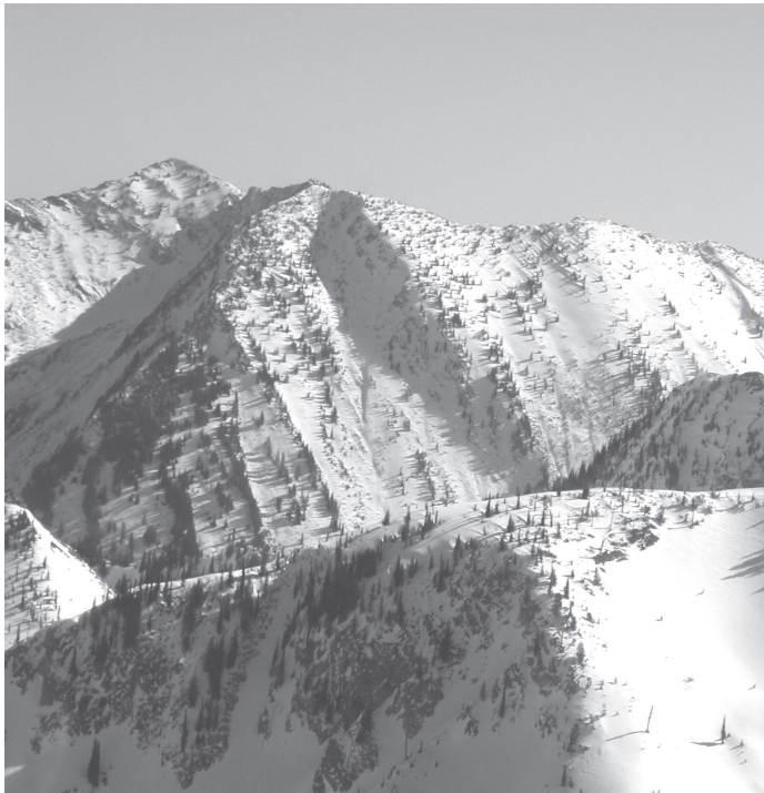
Gospel Hump Wilderness