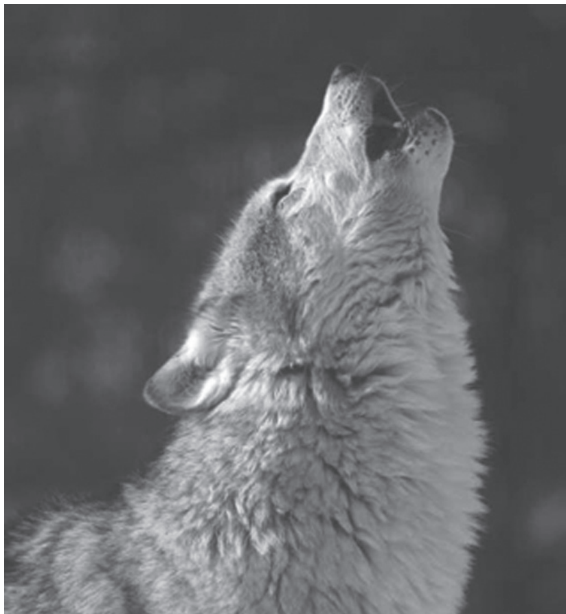
Howling For Justice

By contrast, in a hunted population one could still have 20 wolves, but due to the continual loss of