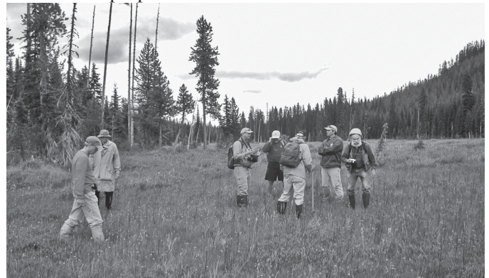
Field Visit With Forest Service Officials

Fortynine Meadows is a unique, sub-alpine peatland ecosystem located near the headwaters of the Little North Fork. The meadow is approximately 500 acres and contains sensitive and rare plant species, including a high diversity of macro-invertebrates. It also provides crucial habitat for Bull Trout and West-slope Cutthroat Trout. We think Fortynine Meadows deserves stronger protection and we look forward to working with the Forest Service to advance this proposal.