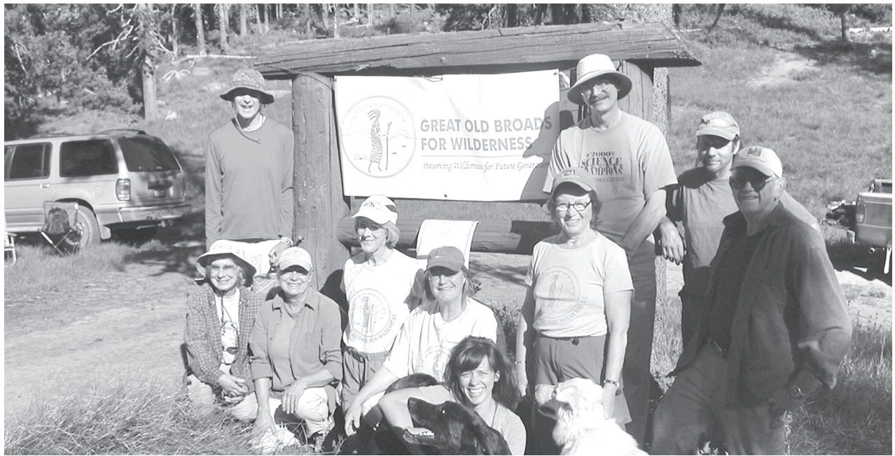
We Want Wilderness Designation For Weitas Creek