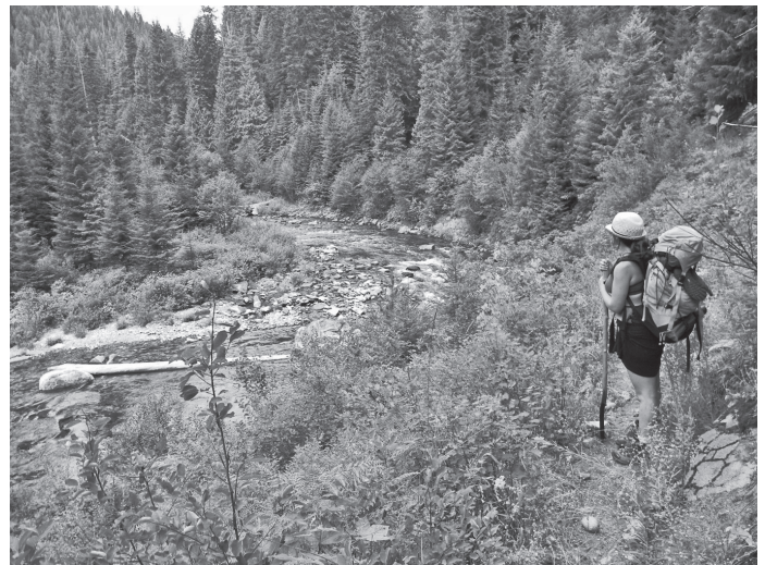
The Lure of the Little North Fork

As we hiked out on our last day, our visions for the Little North Fork Clearwater and Mallard-Larkins Roadless Area crystallized. The Little North Fork Clearwater is a prime candidate for wild river designation under the 1968 Wild and Scenic Rivers Act. With old growth cedar and lush ferns along its banks, along with critical habitat for West-slope cutthroat and bull trout, there is no doubt this river should receive stronger protection from Congress. The Mallard-Larkins deserves full protection under the Wilderness Act too. The “Pioneer Area” is only a small piece of the larger roadless area, and there are still threats from mining, logging and unnecessary Forest Service proposals. Decommissioning a few Forest Service roads would connect more habitat and increase levels of biodiversity. No matter how you access the Mallard-Larkins, make sure you advocate for stronger protections of this stunning place.