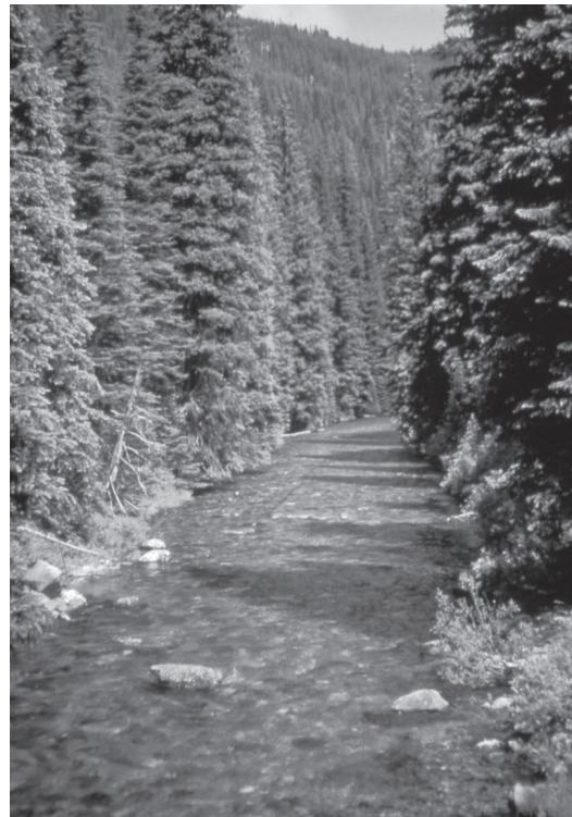
Cayuse Creek

Recently, the Clearwater Basin Collaborative (CBC) has reached a temporary impasse. Crapo’s collaborators have been unable to agree on allocations, logging mandates, and wilderness designations. It is likely that they will cobble-up some quickie proposal before the election year. In 2012, it is unlikely that anything that mentions wilderness will pass. It will be difficult to derail the dreaded collaboration virus. However, if we raise enough hell in the right venues, we can succeed. If we remain passive and let these collaborators speak for us, it’s adios National Forests!