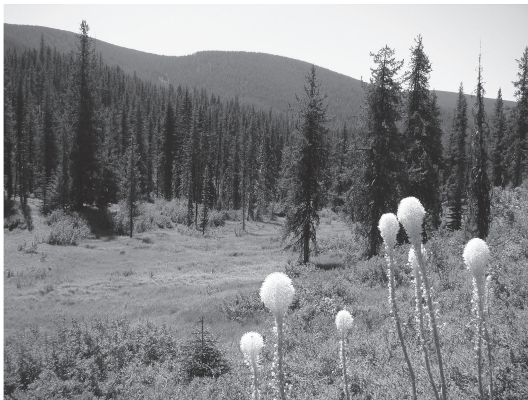
Beargrass in Weitas Roadless Area

The late Ted Trueblood, a noted Idaho outdoor writer and conservationist, said of the earlier sagebrush rebellion, “They’re fixin’ to steal your land.” The threat today is even greater than in the late 70s and early 80s. While it is doubtful this proposal will actually pass Congress, it does indicate a dangerous trend of devolving federal land management to local, so-called collaborative, private, or other special interests. Indeed, other similar measures by anti-conservation forces in Congress have had hearings and committee votes in the House. (Author’s Note: The title is borrowed from Al Espinosa, FOC board member and retired fishery biologist extraordinaire.)