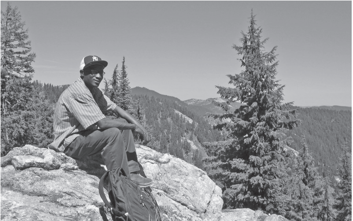
Mallard-Larkins Roadless Area

Unfortunately, this proposal reinforces the stereotype that local western governments are giving the finger to the American public while picking the pocket of the US taxpayer. Western public land states receive more in federal funding than is paid via taxes. How ironic it is that