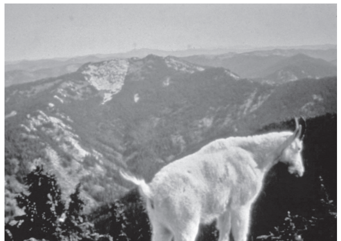
Mallard-Larkins Favorite Haunt of the Ridgerunner and Other Wild Ridgerunners