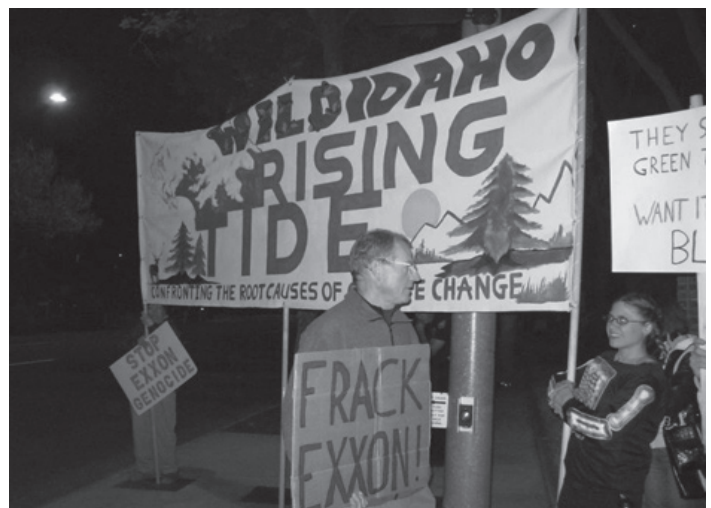
Megaload Resistance in Moscow Grows

Although Moscow is a small city and far from the places of power, we view our efforts as a complement to those elsewhere to stop the Tar Sands project—the actions on Highway 12, the First Nations in Canada working to stop the Enbridge/Kitimat pipeline, and the Washington, D.C. Keystone XL pipeline protests and arrests. United we stand.