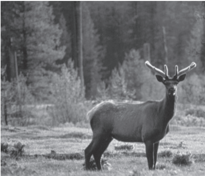
Wild Clearwater Elk