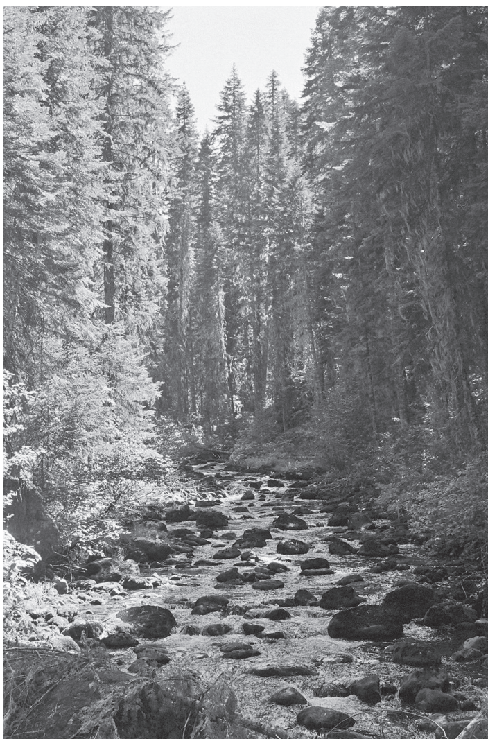
Little Slate Creek

Finally, the Forest Service has abandoned its obligation to protect wilderness character in the Selway-Bitterroot Wilderness. The agency is approving helicopter use for bridge replacement when the original bridge was built by hand, and for maintenance of small earthen dams on lakes on the east side of the Bitterroot Crest when those small dams were originally built by nonmotorized means. Wilderness Watch and Friends of the Clearwater are exploring the possibility of litigation on some of these proposals.