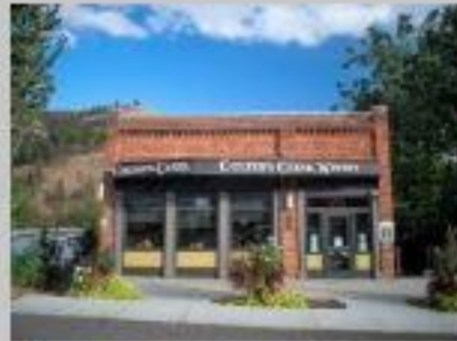
1 Colter's Creek Tasting Room in Juliaetta