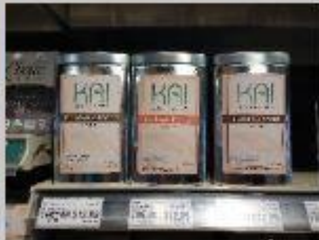
6 Kai Tea