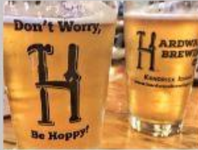
4 Hardware Brewing Company