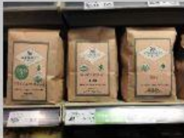
7 Landgrove Coffee