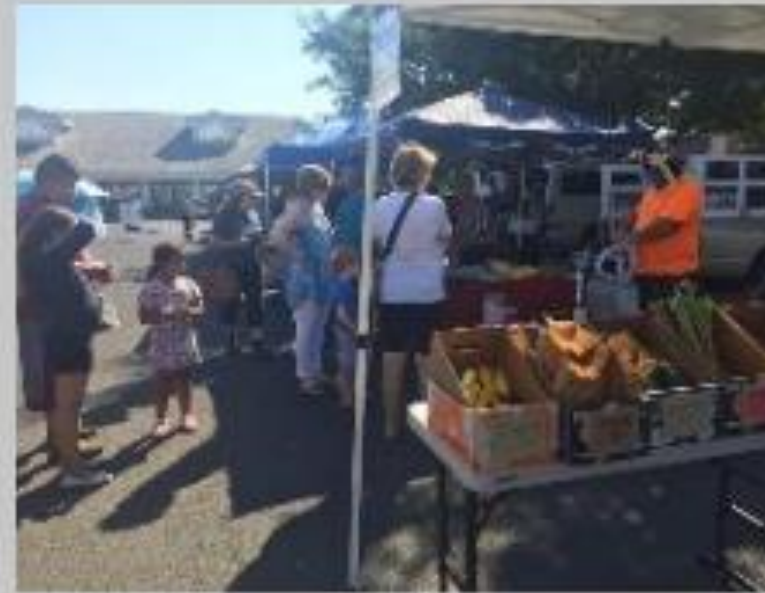
1 Clarkston Farmers Market