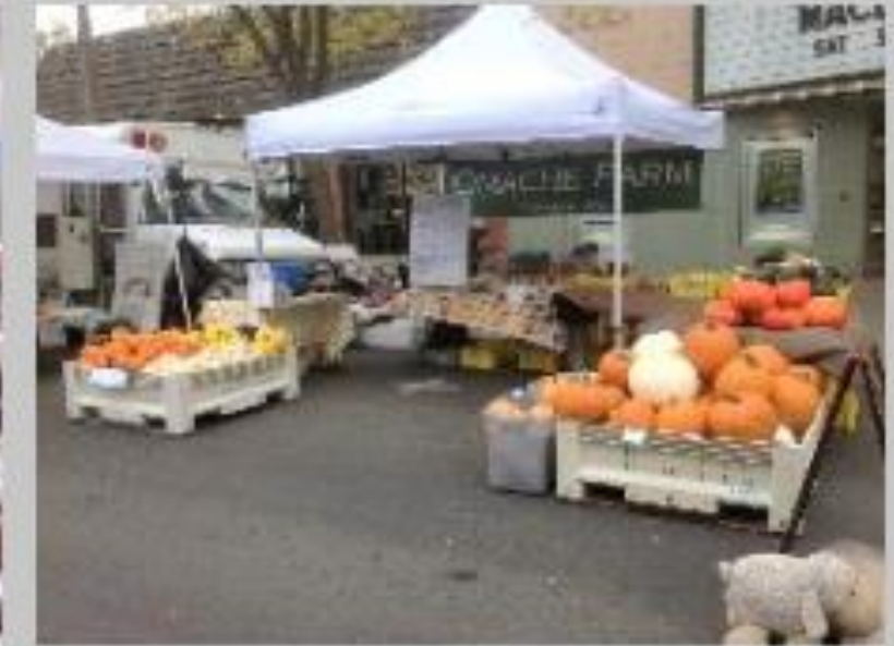
4 Moscow Farmers Market