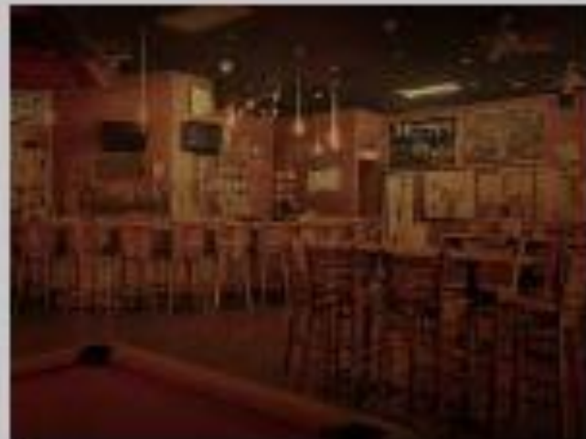
10 MJ Barleyhoppers Brew House