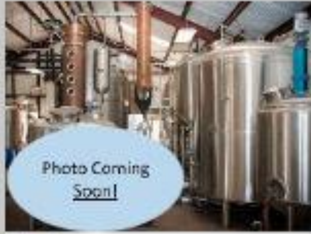
3 Cougar Red Distillery