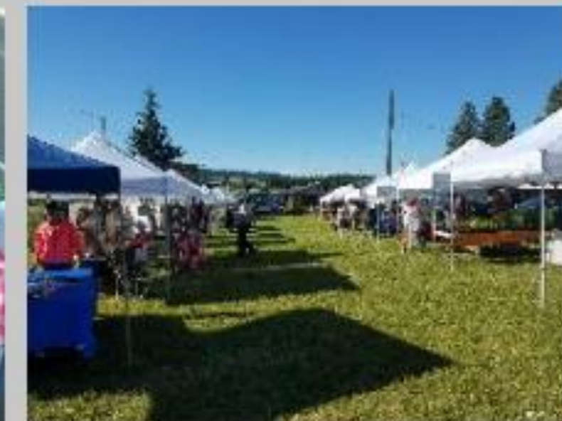
6 One Sky One Earth Farmers Market