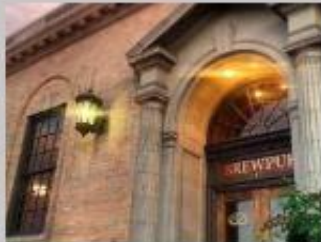
12 Paradise Creek Brewery