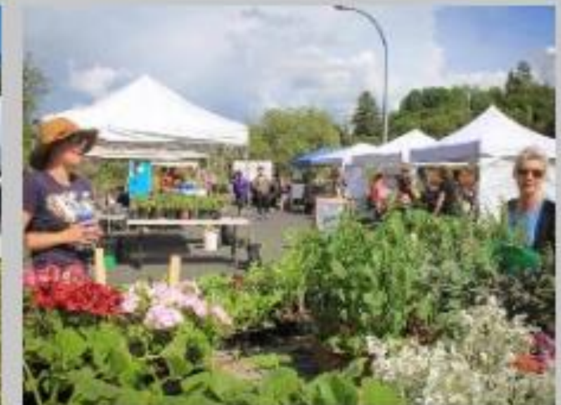
7 Pullman Farmers Market