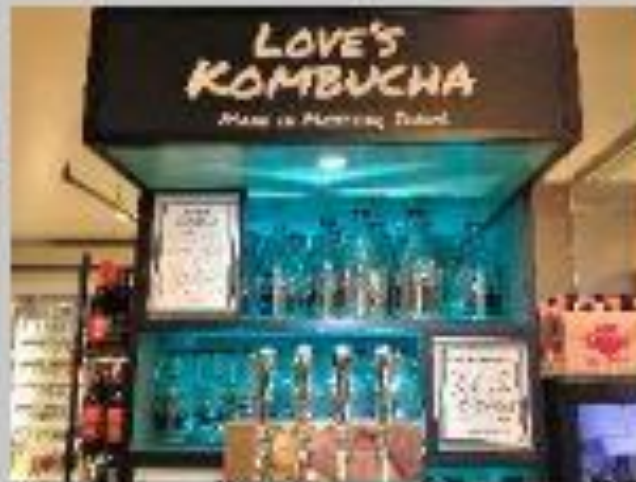
8 Love's Kombucha