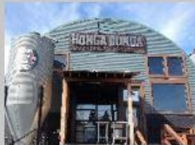
5 Hunga Dunga Brewing Company