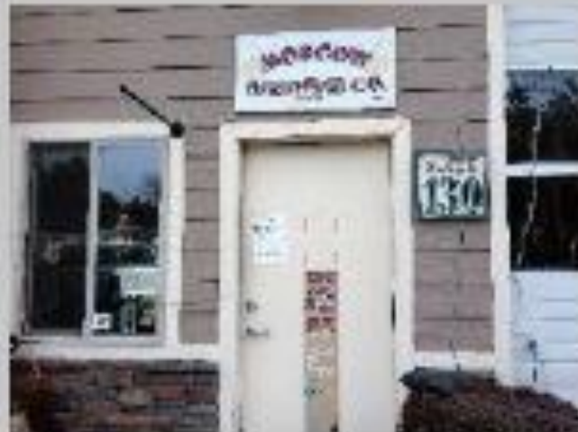
11 Moscow Brewing Company