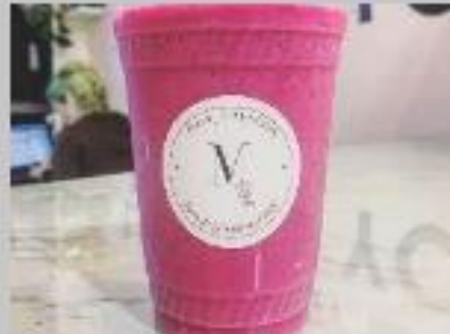
9 Main Street Squeeze Juice & Smoothie