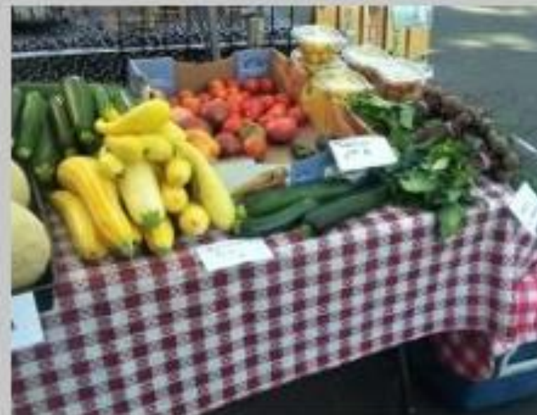
5 Orofino Farmers Market