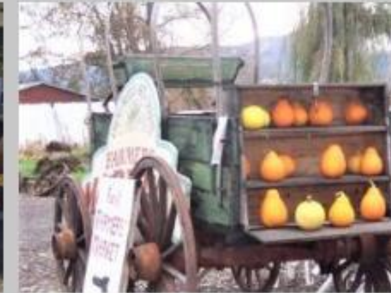
3 Long Camp Saturday Farmers Market