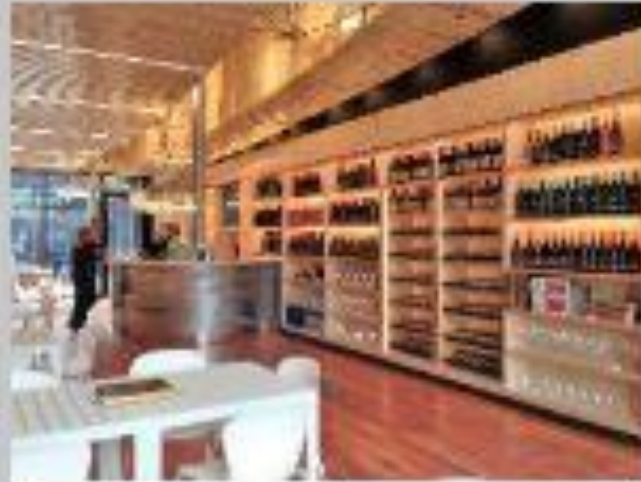
2 Colter's Creek Winery & Tasting Room in Moscow