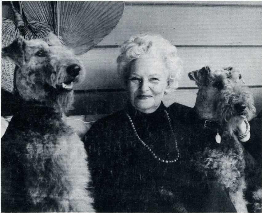
The author and the twin airedales