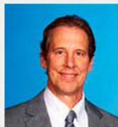
Donald L. Birx