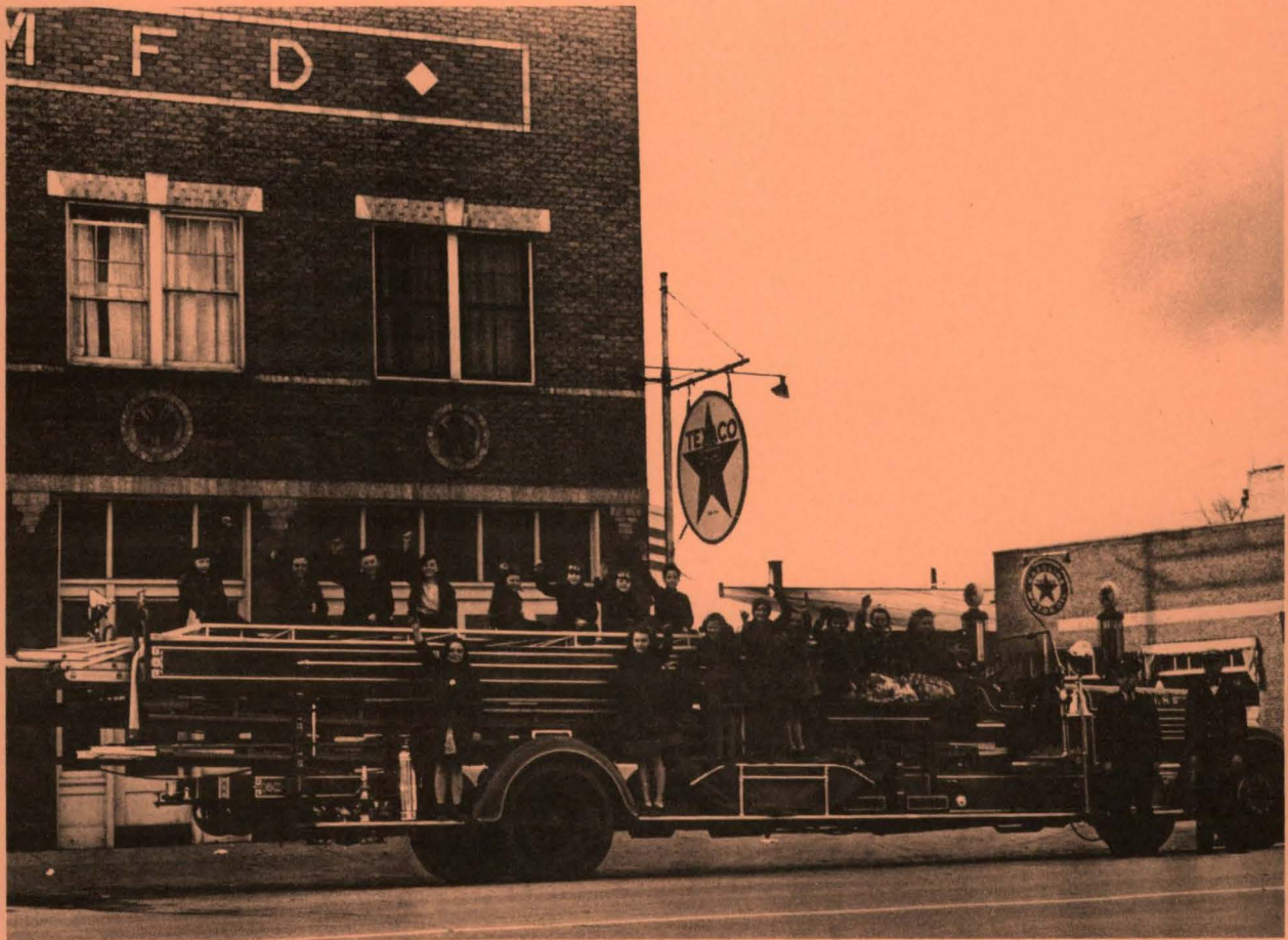
Moscow school children of the 1940's on board the revolutionary Seagrave Aerial Ladder truck of 1936.

The Quarterly Journal of The Latah County Historical Society