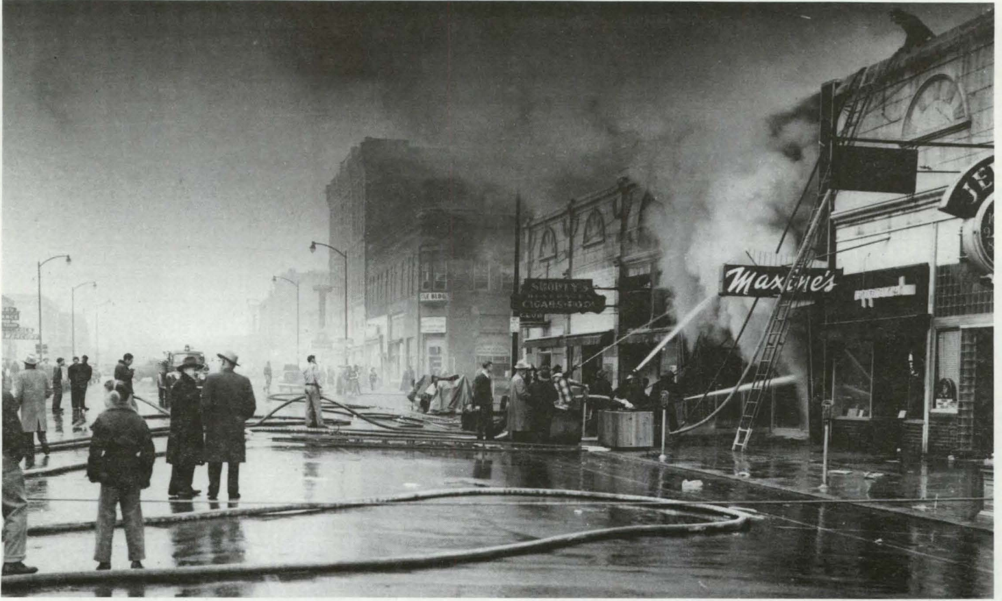
The disastrous Main St. fire of January 1953.