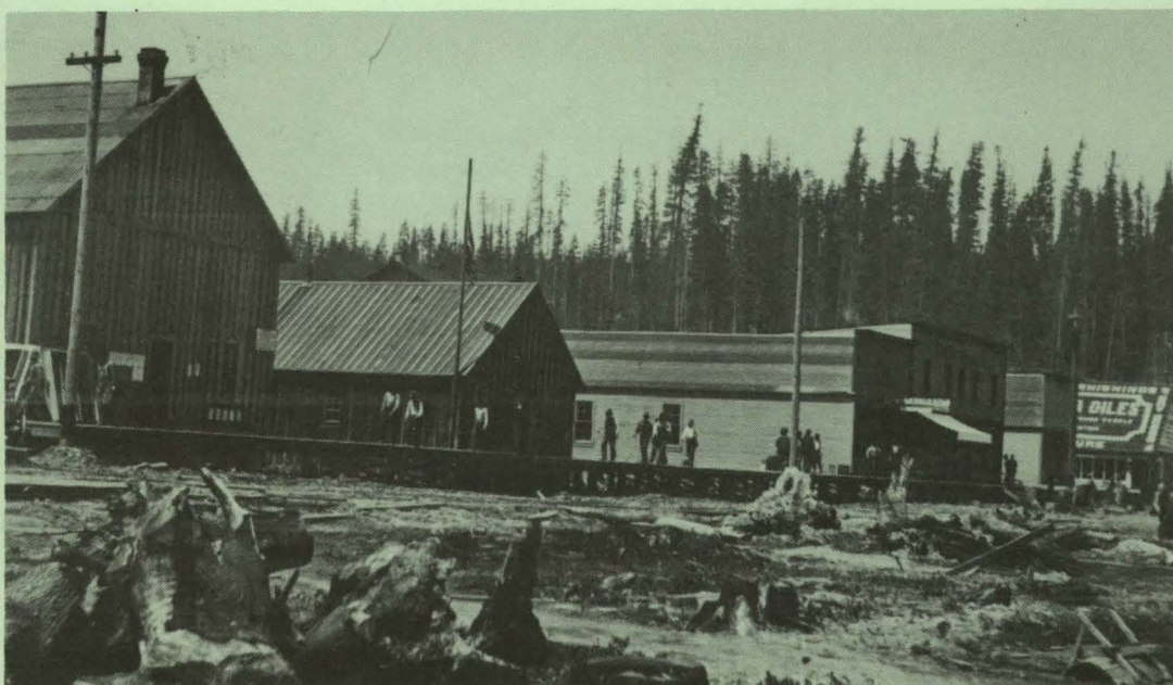
Elk River c. 1900