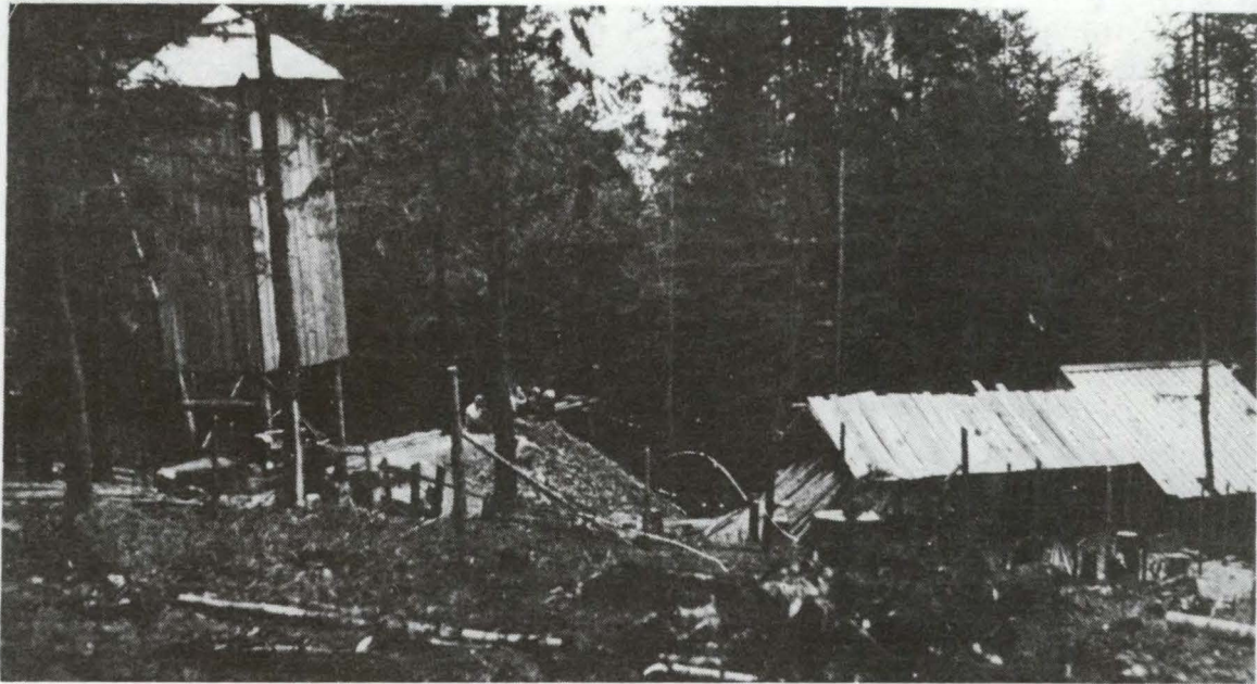
The Wheelbarrow Mine located north of Gold Hill