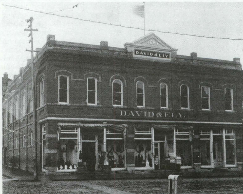
David & Ely c. 1900 (Formerly Dernam & Kaufman)