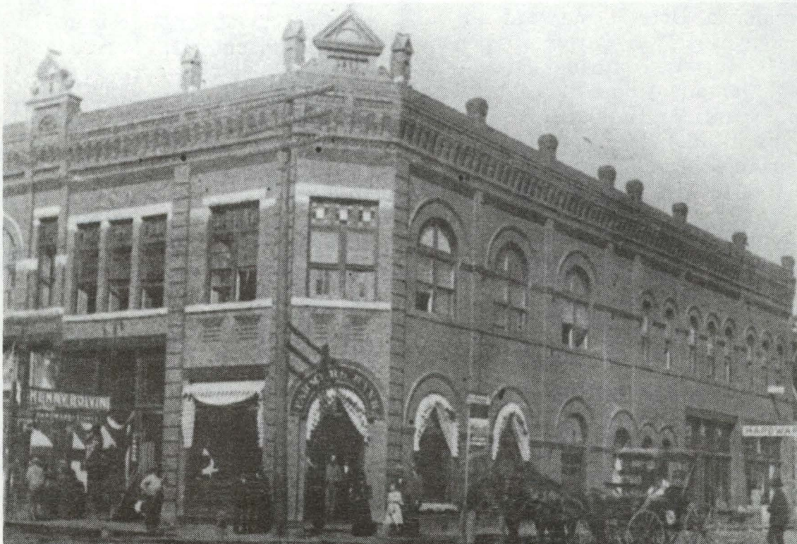
Farmers' Bank of Moscow