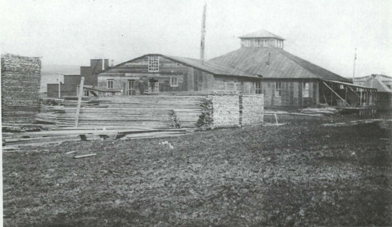
M. J. Shields Co. Planing Mill, 1890s

The stock of goods in this new, elegantly