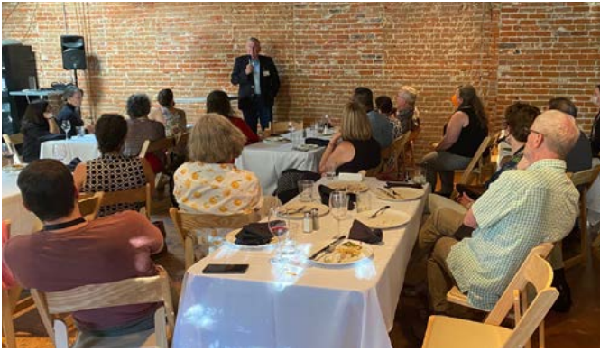
Idaho Speaker of the House Scott Bedke delivers the UNCG annual conference keynote

The McClure Center was honored to host the UNCG annual conference in Boise last month. The conference drew educators and practitioners of collaborative governance from all over the United States, Canada and Finland to the Idaho Water Center.