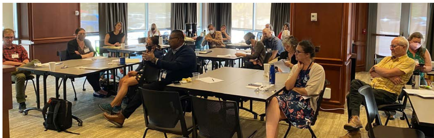
UNCG annual conference

A growing facet of the McClure Center's expertise involves collaborative governance. Collaborative governance can be described as "the process and structures of public policy decision making and management that engage people constructively across the boundaries of public agencies, levels of government, and/or the public, private and civic spheres in order to carry out a public purpose that could not otherwise be accomplished."