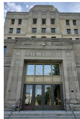
Capitol Annex: Old Ada County Courthouse