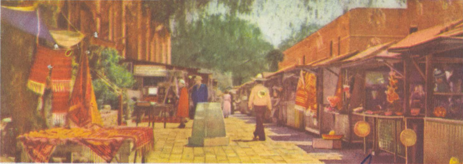
OLVERA STREET, LOS ANGELES, CALIFORNIA

Testimony of your life life Life is really done one very God: and I also Love to Fasting and Prayer fore others. fore weak those that are not able to stand against power of Satan Bound Hell and I been praying fore a pick up outomobile to ride in: where I could use it to sleep and pray and Fasting in it , and I thought you could some how help me out. where I could