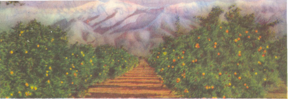
ORANGE GROVE AND SNOW CAPPED MOUNTAINS IN CALIFORNIA

Dear Brother in Christ I writ you a few Lines to let you know. that I just had to writ to you a Letter about you had a wonderful experinances with God. where God himself was talking to you thats true. not only that. But Healing power. where my hand was on fire on stove burning red hot and when I was reading your storey the