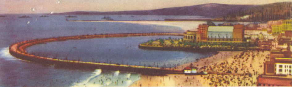
LONG BEACH, CALIFORNIA

if God answers my [9] prayer I will do nothing else But to prayer Fasting and make a big altar call to cry out the Gosple fore sinners saved I am not a very good writer. this is the Best way through prayer and Fasting amen