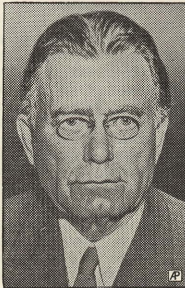
WILLIAM E. BORAH

For Senator Borah is more beautiful in death than he was in life. If I can be half as true to my ideals and